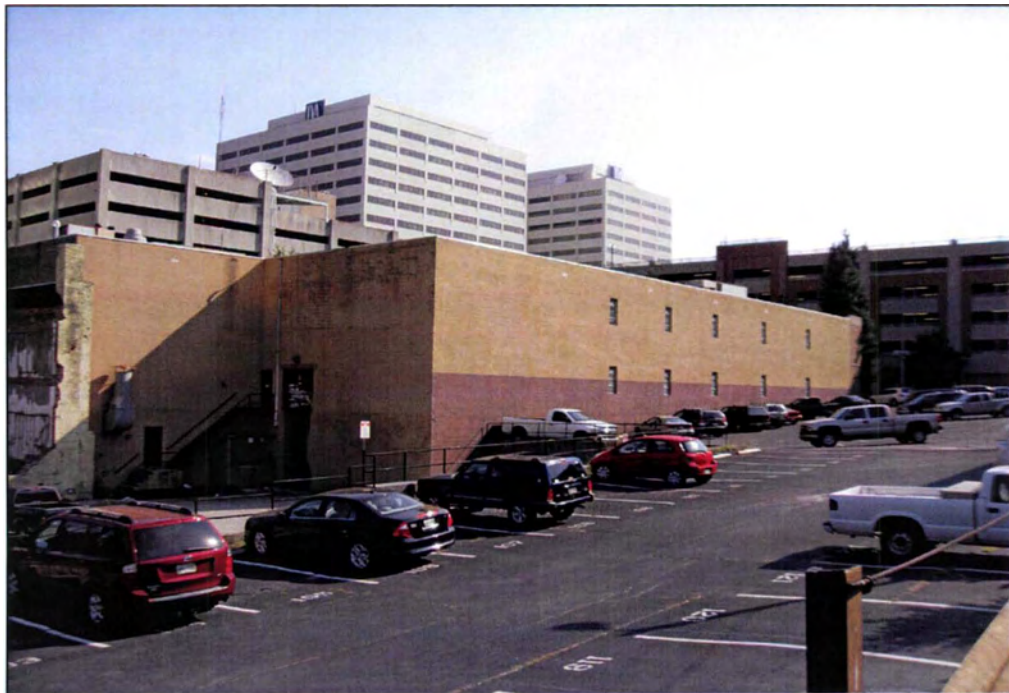
Figure 3-2 View of Northwest Corner of Property - Exposed Basement