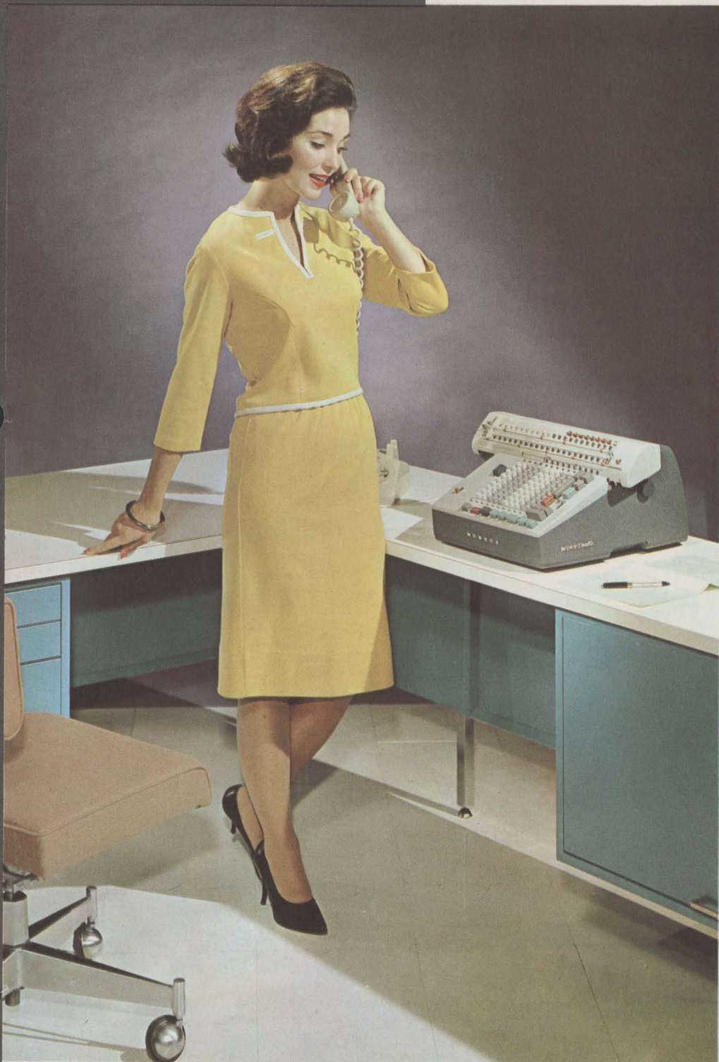
FURNITURE BY COLE STEEL