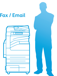
WorkCentre 5335 with High-Capacity Tandem Tray

23.5 x 25.1 x 43.9 in. 597 x 637.5 x 1,115 mm