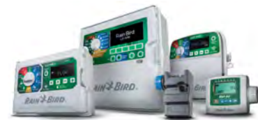
Rain Bird Controller Family

(B) AUTOMATIC IRRIGATION CONTROLLERS Rain Bird offers a full line of smart controllers , all with non-volatile memory.