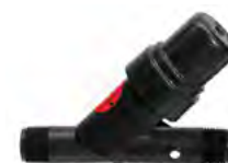
Pressure-Regulating Filter (RBY)