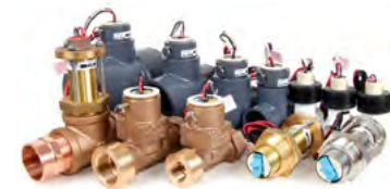
Flow Sensor Family

(G) FLOW SENSORS Rain Bird offers a complete family of flow sensors .