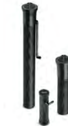
RWS Root Watering System

(C) TREES The Root Watering System (RWS) enables vital water, oxygen, and nutrients to bypass compacted soil and directly reach tree and shrub root systems.