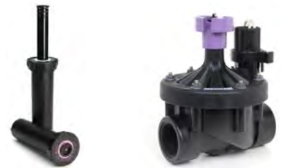
RD1800™ Series Sprays | PESB-R Series Valves

Rain Bird offers components designed specifically to withstand the harsh conditions found in recycled water, like the RD1800™ Series Sprays and PESB-R Series Valves .