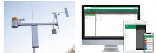
WS-PRO LT Weather Station | IQ Remote Water Management