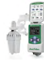
WR2 Wireless Rain Freeze Sensor

(D) WEATHER SENSORS Rain Bird offers wireless rain/freeze sensors . Anemometers are also available with central control.