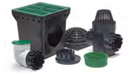
Rain Bird® Drainage Products

Rain Bird offers a complete family of drainage products .