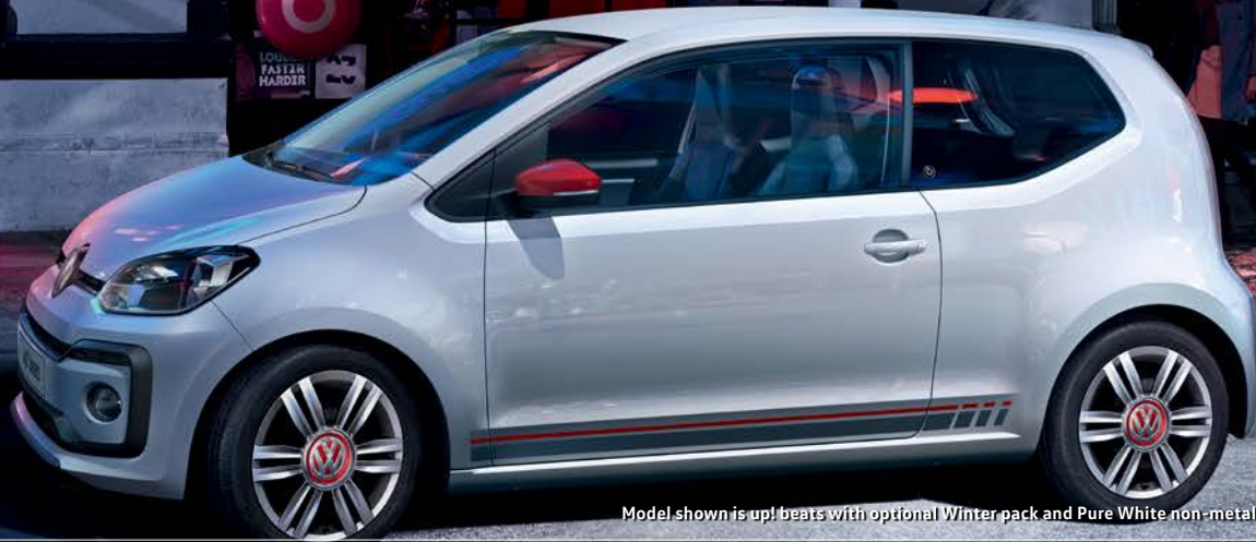
Model shown is up! beats with optional Winter pack and Pure White non-metallic paint.