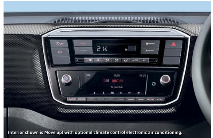
Interior shown is Move up! with optional climate control electronic air conditioning.