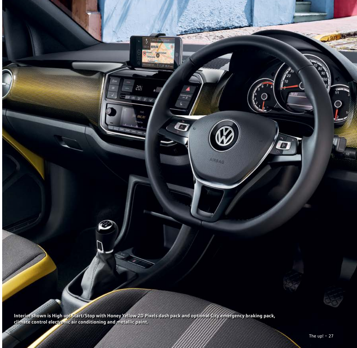
Interior shown is High up! Start/Stop with Honey Yellow 2D Pixels dash pack and optional City emergency braking pack, climate control electronic air conditioning and metallic paint.