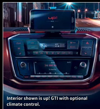
Interior shown is up! GTI with optional climate control.

The specifications listed are for information purposes only as our products are continually updated and changes may be made to the specifications at any time. If you require any specific feature, please consult your authorised Volkswagen retailer who is regularly updated with any change in specification. Specifications are subject to change without notice. Models shown features optional Pure White non-metallic paint.