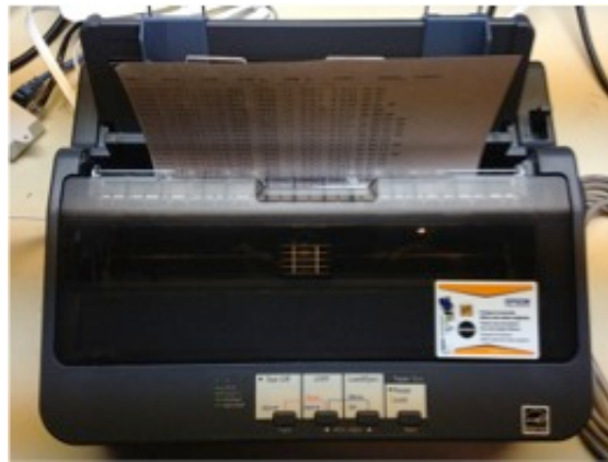
Printer Kit PN: 11544943

The new printer kit for the TEC3000 will change to an improved printer model, LX-350. The new Epson printer model is more robust and easier to setup. The previous model LX300 will be obsolete. The same part number, PN: 11544943 , will be used to order the printer kit.