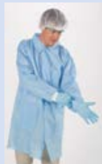
Medical Blue Lab Coat