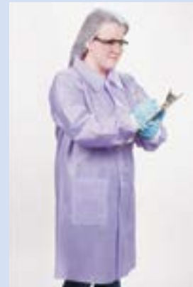
Purple Lab Coats