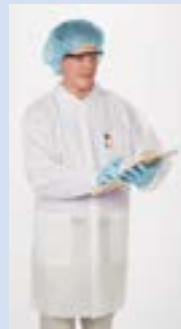
White Lab Coat