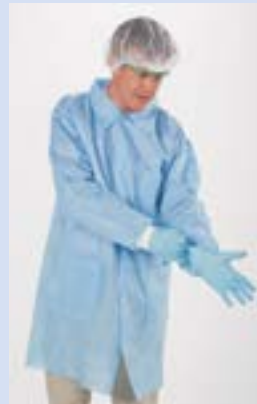
Medical Blue Lab Coats