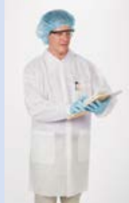
White Lab Coats