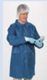
Navy Blue Lab Coat