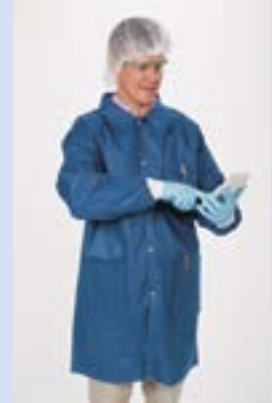
Blueberry Lab Coats