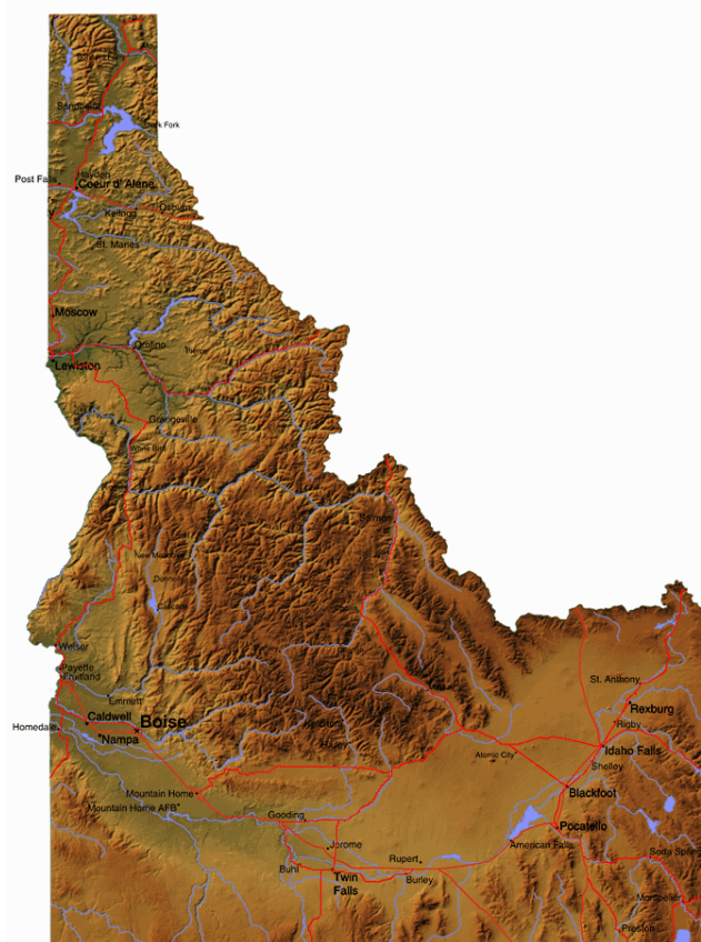
Figure 1 – Idaho Terrain

Idaho has a very diverse geography, ranging from high desert to mountainous terrain as illustrated in Figure 1 below. The Idaho Transportation Department has, over the years, developed a progressive winter maintenance program which involves investment in a number of areas such as labor, training, equipment and materials. Typical treatment materials include salt, salt brine, magnesium chloride and anti-skid. These materials are applied by a winter maintenance operations fleet of 500 plus vehicles to maintain highways in order to promote safe travel and winter mobility.