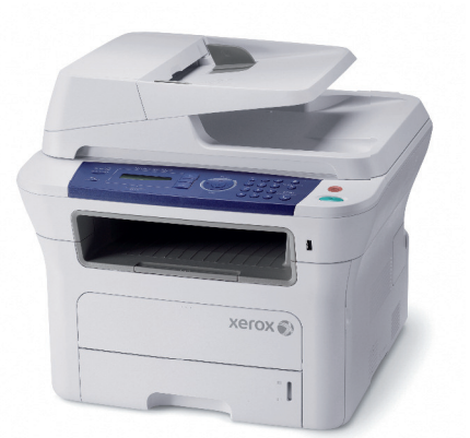
The WorkCentre 3210/3220 is an office-space saver – combining print, copy, scan and fax functions in one convenient, compact device.