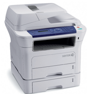
WorkCentre 3210/3220 shown with second 250-sheet paper tray (optional).

Set-up has been simplified and streamlined; the multifunction printer is easily installed and can be quickly integrated into an existing network. Most configuration, monitoring and troubleshooting can be managed from the user's computer, and the highly intuitive front panel offers large, easy-to-read buttons for common functions. Its usability-conscious design gives the multifunction printer only a single customer-replaceable cartridge, keeping maintenance to a minimum.