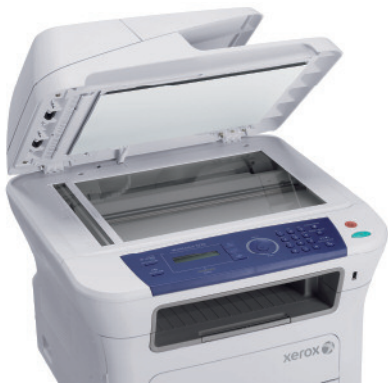
The WorkCentre 3210/3220 includes a platen glass for single-sheet copying and a 50-sheet ADF for larger copy jobs.

Consider the features that come in the box, as well. The ideal multifunction printer package should include everything needed to get the device performing on the network immediately. Security also plays a role in the value equation. Failure to protect a confidential fax, for example, could incur liabilities that far exceed the simple cost of the device.