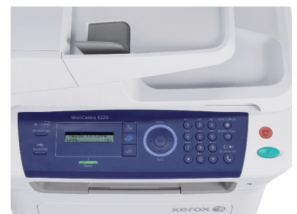
Whether printing, copying, scanning or faxing, the easy-to-navigate user interface intuitively guides users from start to finish.