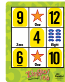
"X Marks the Spot"