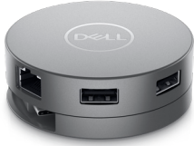
DELL USB-C MOBILE ADAPTER | DA310

Featuring the widest variety of ports available, the compact 7-in-1 Dell USB-C Mobile Adapter offers seamless connectivity to various devices like monitors, projectors, headsets, keyboard, mouse, flash drives and other accessories.