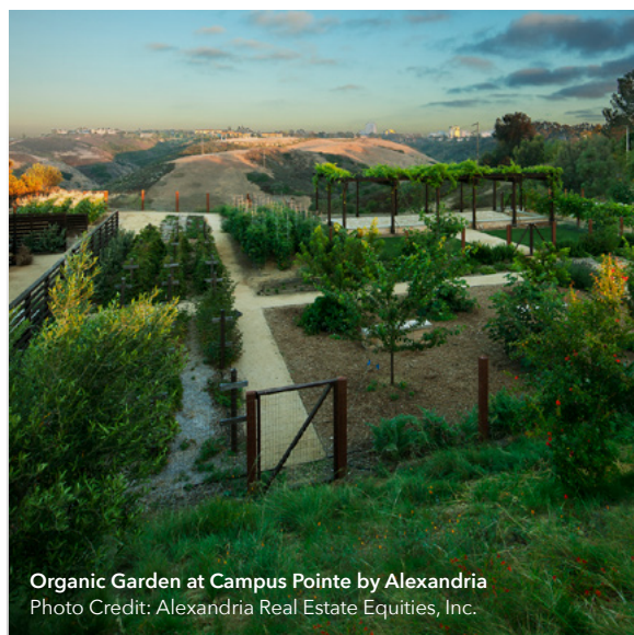
Organic Garden at Campus Pointe by Alexandria