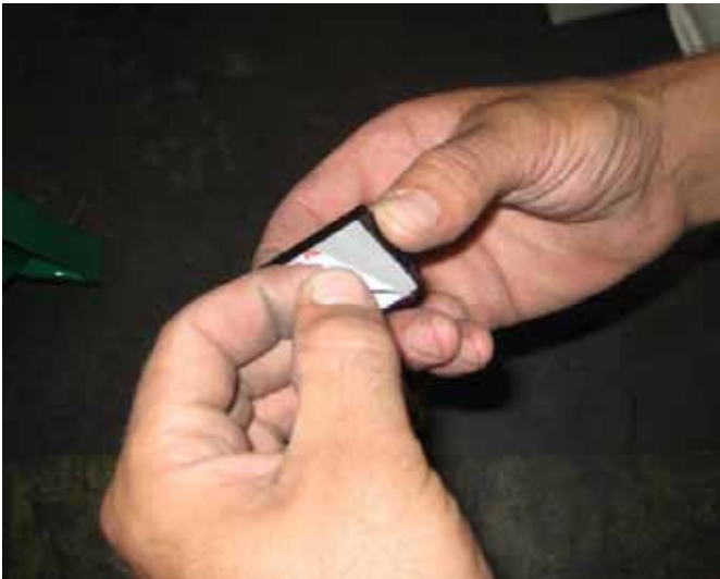
Figure 2. Peeling Off Adhesive Backing