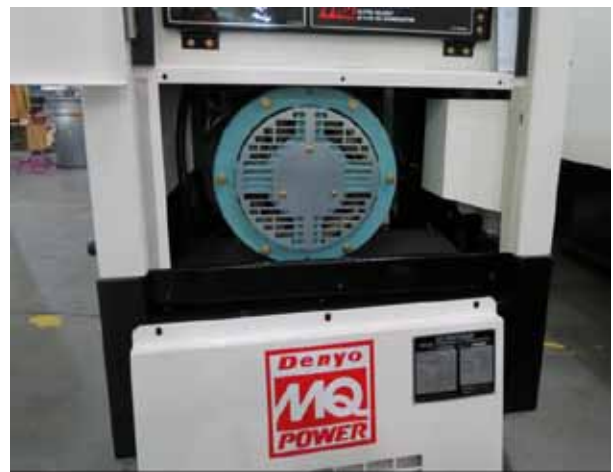
Figure 5. Removing Front Panel