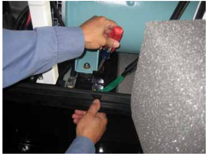
Figure 4. Checking Adhesive