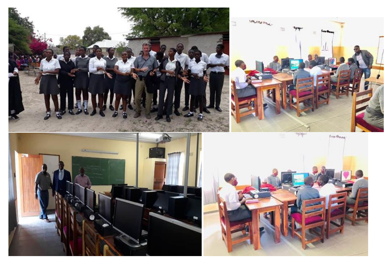
Kanono Combined School was also part of our recipients for the Back to School Xmas Bag and the academic results are excellent! Well done to all the learners and their teachers!

We recently visited the school and the learners are doing very well and they are studying on alternative basis so everyone can benefit from the computers and the IT class.