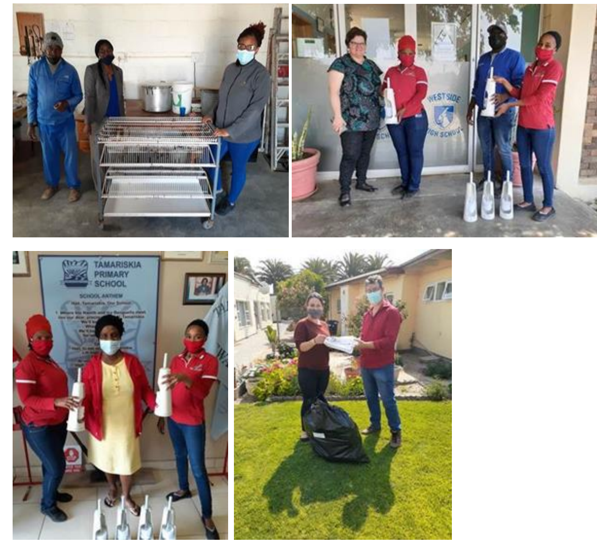
Follow up : ESB ROCKET STOVE - Namibia

Here are some of the lucky recipients: John Awaseb School, Lions Old Age Home, Tamariskia Primary school, Vrede Rede Soup Kitchen, Vrede Rede, West Side High Donation.