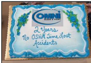
Congratulations to everyone for 2 years no OSHA time lost accidents!