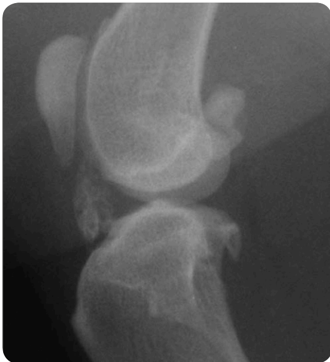
Figure 3. Mineralization of the intra-articular structures in the stifle of a seven-year-old male neutered cat. There is also mild periarticular osteophytosis of the stifle with new bone on the proximal pole of the patella and trochlear ridge.

Although the combination of appropriate clinical signs and physical examination findings may lead you to be fairly certain a cat has OA, it is ideal to try to confirm your suspicions by seeing radiographic changes. The primary radiographic change associated with osteoarthritis is the presence of periarticular osteophyte formation, although this is not always present or easily identifiable in every case. It is important to appreciate that osteoarthritis may be present in the absence of obvious radiographic changes. Contrarily, the presence of radiographic changes does not always correlate with clinical signs of osteoarthritis nor the degree of pain suffered. Occasionally, cats develop excessive periarticular mineralization and ossified bodies adjacent to their joints, particularly in the stifle joint ( Figure 3 ).