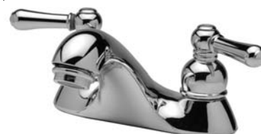
Z74500 4" Centerset Faucet

Cold Water Cartridge 59517001 Hot Water Cartridge 59517002