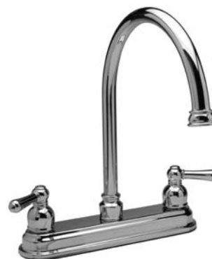
Z74700 8" Centerset Gooseneck