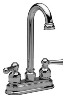
Z74600 4" Centerset Gooseneck