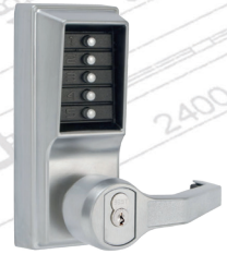
BEST interchangeable cores