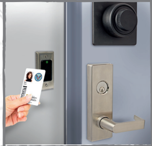
X-10 High security locks