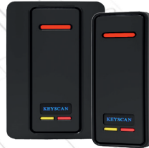
Electronic access controls