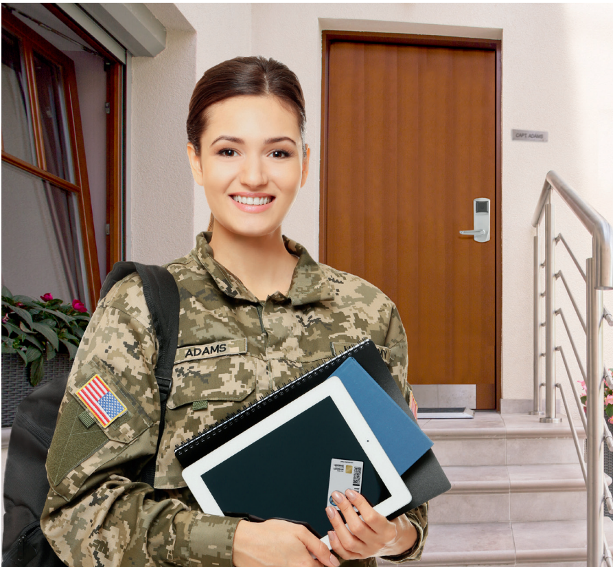
Military housing access solutions Saflok RT™

NOTE: Not all products are available through all programs.