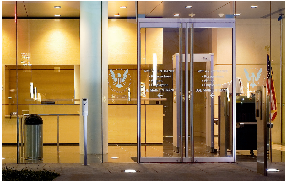
William Jefferson Clinton Presidential Library — LM Series pivots, BTS80 Series concealed door closers, TS93 Series surface closers