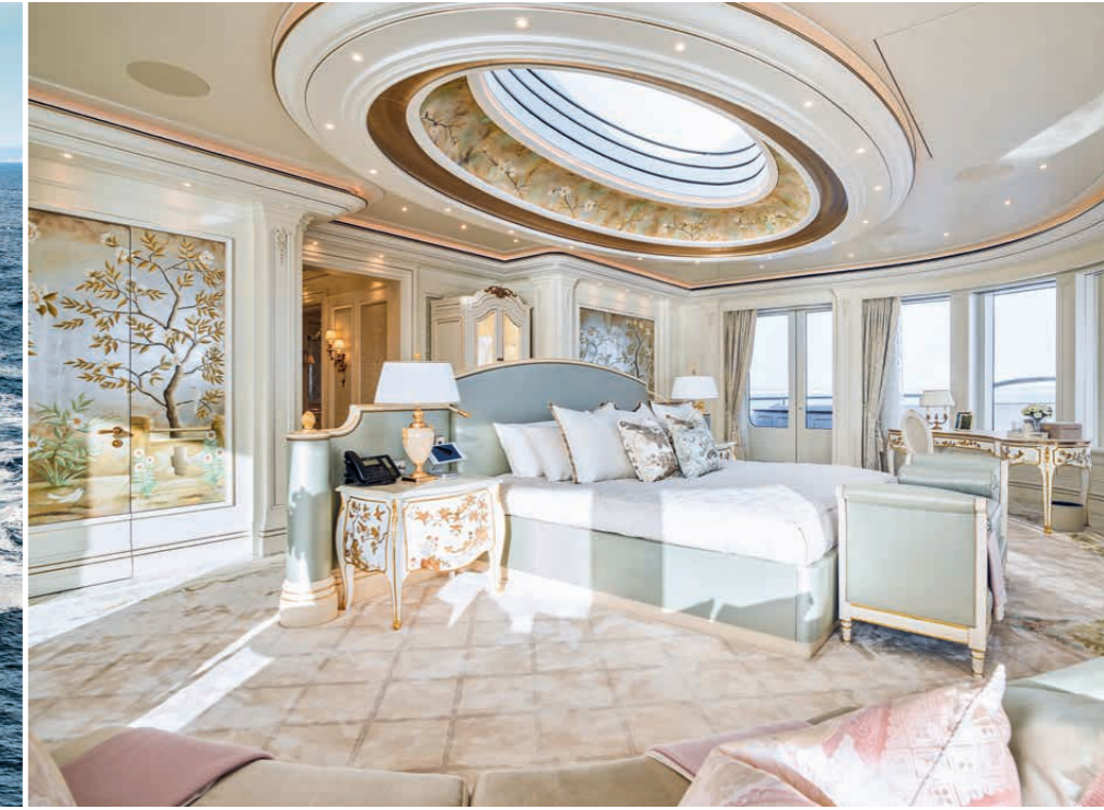
Owner's dream space: he dispensed with freshwater facilities forward of his suite, but got sponson balconies and exclusive access to the certified helideck instead. The carpet is made of silk, while the walls are hand-painted. A four-metre-long oval skylight allows stargazing.

owner's behind-closed-doors retreat the barefoot visitor walks on the finest silk carpets out onto the teak deck, which features two seating arrangements and two sunbathing areas forwards instead of a swimming pool. Another place to relax outdoors are the sponson balconies, whose doors on the side decks seal them completely from the rest of the yacht. That provides privacy and gives the owner exclusive access to the fully certified helideck, on which choppers