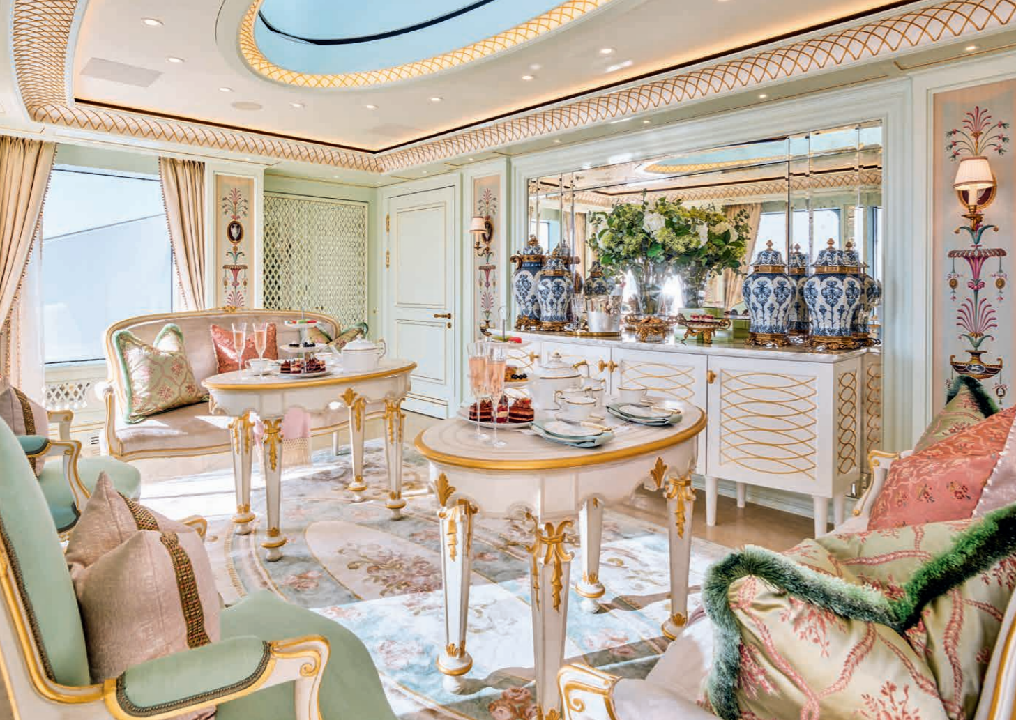
Comme il faut: the owner's macaron-loving wife wanted a tea salon similar to the one at Café Ladurée in Paris. The Four Seasons in Florence inspired the design of the lobby (b.). Ceiling domes incorporate non-flammable-impregnated leather and Preciosa crystal chandeliers.

Seasons Hotel in Florence. As on the entire owner's deck, the walls are 2.60 metres high here instead of 2.25 metres. Winch Design filled the ceiling space aft with two domes, which encompass