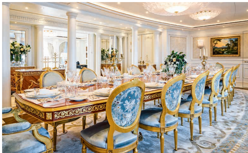
Spacious: up to 18 people can dine and overnight on board. Tuscan columns lead into the owner's office to starboard, which features an inviting fold-down balcony.

A lift (with seat!) or a spiral staircase, which is an exact replica of the one in the Le Bristol, takes the owner to his bel-étage on Deck Three – it would be Deck Four if you include the tank deck. If you walk up the grand staircase, you reach the lobby, which was inspired by the Four