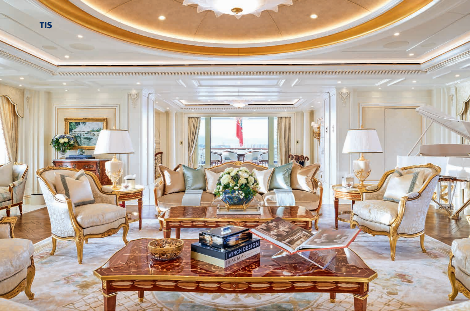
Main deck saloon: to comply with strict PYC rules, the wall and ceiling panels were made of expanded glass, which is non-flammable and the streaked lacquer coating creates the perfect illusion of wood. The Steinway & Sons Spirio grand piano plays as if by magic.

located to port aft of the monumental staircase, the non-flammable expanded glass wall panels had to be bent to such a degree to ensure they fitted into the