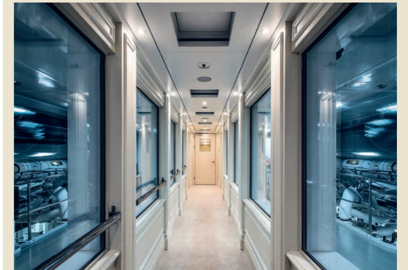
Glass centre: the corridor with views of the engine room links the lower-deck guest accommodation with the lift and stairs as well as with the cinema.