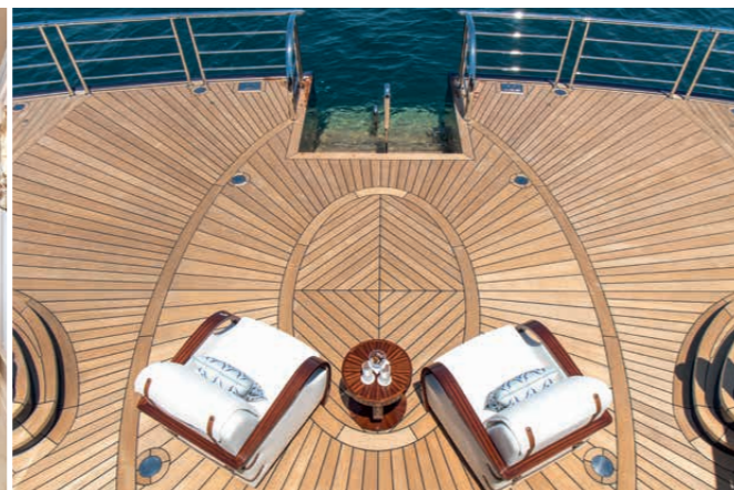
Man cave: aboard “Tis” the beach club is a sports bar with sauna attached, a very private area for the owner and his friends, well-shielded from prying eyes. The stern platform, with a few steps into the water and of course imposing staircases, offers a grand entrance.