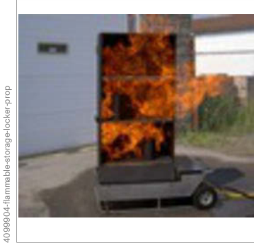
Flammable Storage Locker