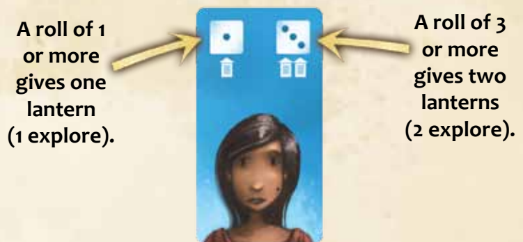
This villager could give either 1 or 2 lanterns (not 3).

The active player rolls one die for each villager that was sent into the cavern (on the cave card). He must indicate for which villager he is rolling each time he rolls. Once rolled, he places the die on the villager. The amount of lanterns gained by the villager depends on the roll, as described below: