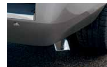
Highly Polished Exhaust Tip