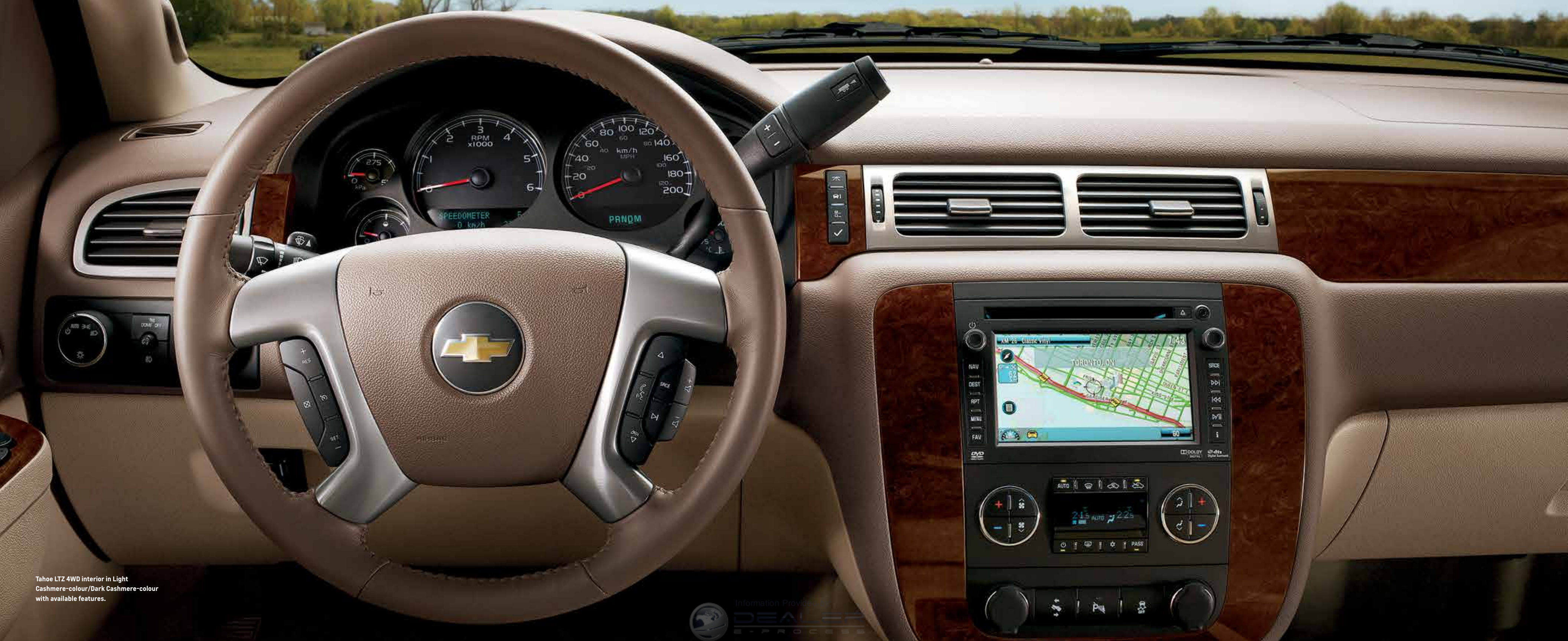
Tahoe LTZ 4WD interior in Light Cashmere-colour/Dark Cashmere-colour with available features.