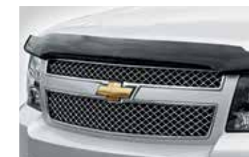
Moulded Hood Protector