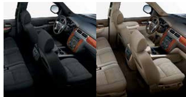
Ebony Premium Cloth 1