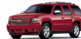
89U - CRYSTAL RED TINTCOAT *