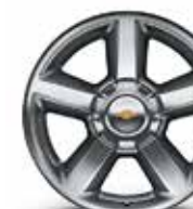
20" Polished-Aluminum (Standard on LTZ; available on 1LT and 2LT)