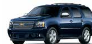
GWU - CONCORD METALLIC †

* Available at extra cost. ** Available on LTZ only. † Not available with Z71 Off-Road Suspension Package.