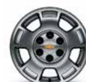
17" Aluminum (Standard on LS, 1LT and 2LT)