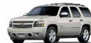
GWT - CHAMPAGNE SILVER METALLIC †