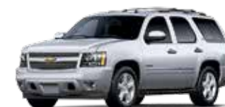
GAN - SILVER ICE METALLIC