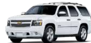
50U - SUMMIT WHITE