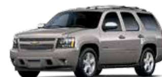
GHA - MOCHA STEEL METALLIC