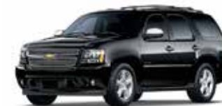
41U - BLACK