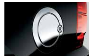
Chrome Fuel Door

PERSONALIZE YOUR TAHOE OR SUBURBAN AT CHEVROLET.CA