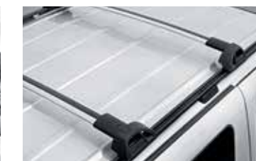
Roof Rack Cross Rail Package