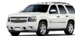
98U - WHITE DIAMOND TRICOAT **