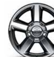
20" Chrome-Aluminum (Available on LTZ)