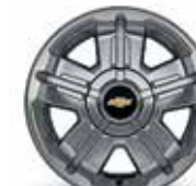
18" Aluminum (Available on 1LT and 2LT; requires available Z71 Off-Road Suspension Package)