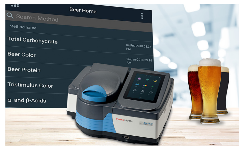
With 20 ASBC methods, Beer Craft Software and GENESYS UV-Vis Spectrophotometers make it easy to select and test various critical parameters. Store and organize data by batch names for easy retrieval later.

We feel that sensory is ultimately the single most important quality test we have here at pFriem. However, measuring samples by spectrophotometry and generating quantification values for important beer analytes has been critical for us staying constantly in control of our process, quickly identifying drifting, and ensuring consistent quality for all of our beer.