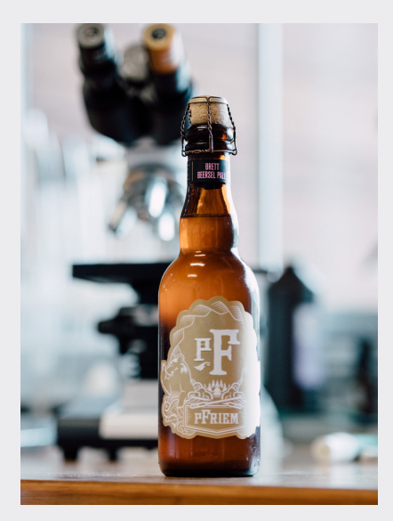
Pfriem laboratory.

"...we've found the spectrophotometer to be an invaluable tool for routine beer testing on numerous levels. It is so amenable to many types of testing that it has quickly become an integral part of our quality laboratory. After having had a spectrophotometer, I could not imagine running a beer quality program without one."