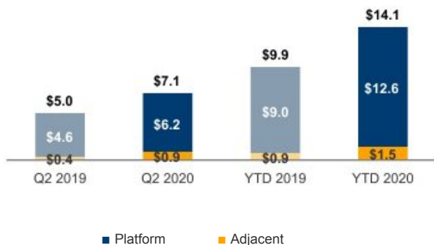
DCG REVENUE $B