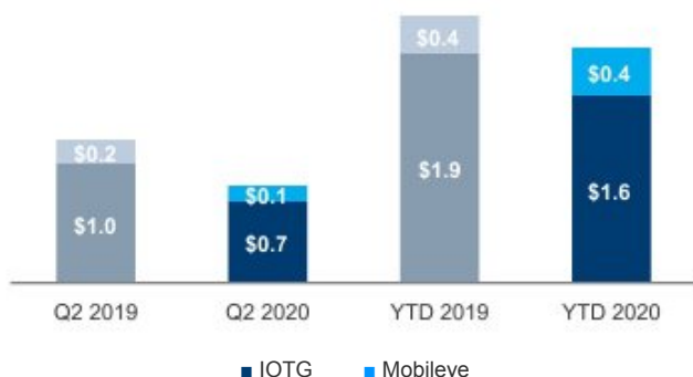
INTERNET OF THINGS REVENUE $B