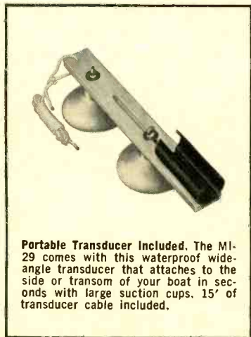
Portable Transducer Included. The MI-29 comes with this waterproof wide-angle transducer that attaches to the side or transom of your boat in seconds with large suction cups. 15' of transducer cable included.