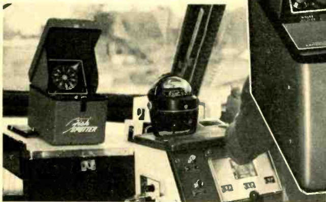
Or as an accurate depth sounder