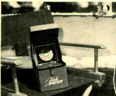
Use it as a fish spotter