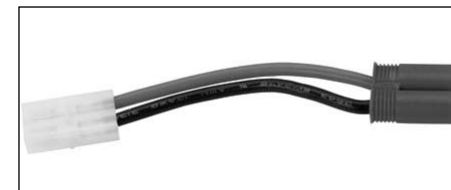
DYN5002 Charge Adapter Tamiya Female: EC5 Female