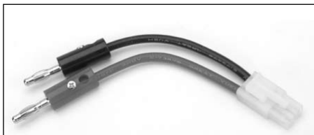
DYN5005 Charge Adapter Banana to Tamiya Male