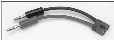
DYN5007 Charge Adapter Banana: EC3 Female