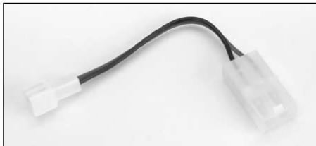
DYN5004 Charge Adapter Tamiya Female to Losi Mini