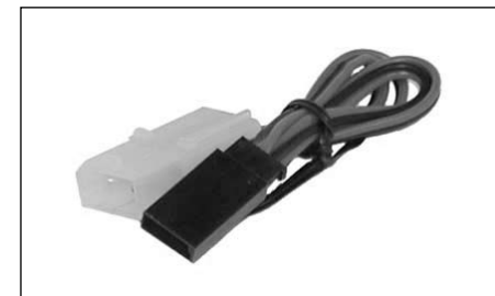
DYN4003 Receiver Pack Charger Adapter

The Passport DC Li-Po 6S Charger includes the Deans Ultra Style Charge Cord (DYN5006) and banana to BEC charge cord. Dynamite offers charge cords and adapters for all your battery charging requirements. See the list below to order additional connectors.