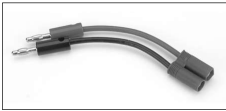
DYN5008 Charge Adapter Banana: EC5 Female