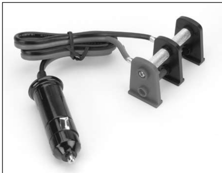
DYN5010 12V DC Power Adapter with Cig Plug