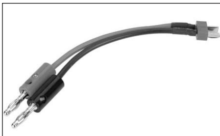
DYN5006 Charge Adapter Banana: Deans Ultra Male