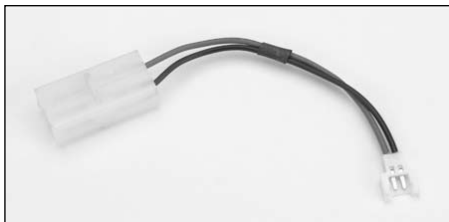
DYN5003 Charge Adapter Tamiya Female: Losi Micro