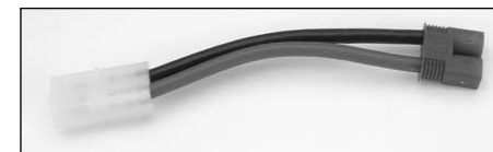
DYN5001 Charge Adapter Tamiya Female: EC3 Female