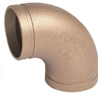
Copper Publication 22.04