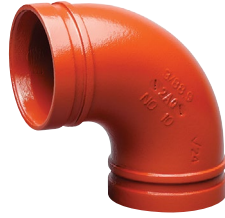
No. 10 Elbow