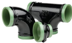
Extra Heavy EndSeal "ES" Publication 07.03