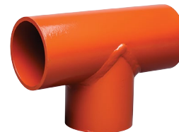
Plain End Publication 14.04