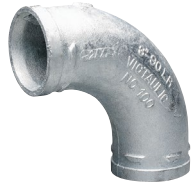
Galvanized Publication 07.01 for Original Groove Fittings Publication 20.05 for AGS Fittings