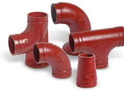
Ductile Iron for AWWA size pipe Publication 23.05