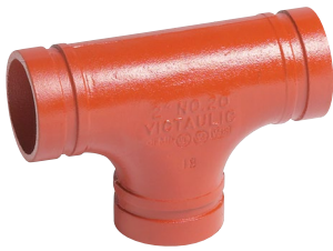
No. 20 Tee