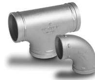
Aluminum Publication 21.03