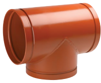
AGS - Advanced Groove System from 14 – 60"/DN350 – DN1500 Publication 20.05