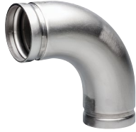
Stainless Steel Publication 17.16