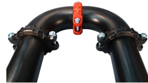
XL fittings for abrasive services Publication 07.07