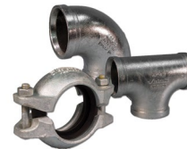
Shouldered Ends Publication 07.06