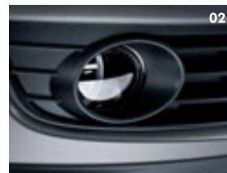
02 Front fog lights.

The exterior styling of a car is not only an expression of its personality, but makes a powerful statement about your own individuality and taste. These factory-fitted options provide an easy and effective way to create a striking visual appearance with great aesthetic appeal, while enjoying some important practical benefits. From heat insulating tinted glass to front fog lights, choose the options best suited to your needs and enhance not only your Jetta's exterior looks, but your driving experience too.