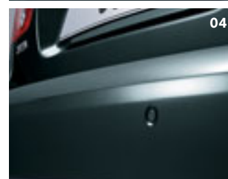
04 Parking sensors (Sensor pack).

Safety and security have to be a primary consideration, for only when you are feeling totally safe and protected can you completely relax. Whether you are looking to ensure the safety of your passengers, enhance rear safety or make life just that little easier, this range of safety and security features will help you protect passengers and make your Jetta more secure, enabling you to enjoy the driving experience so much more.