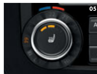
05 Heated front seats ('Vienna' leather upholstery).

The interior of your car is all about aesthetics and luxury, leather upholstery enables you to create a sumptuous interior that is tasteful, elegant and attractive, meeting your individual needs perfectly, and providing the highest levels of comfort and driving pleasure. Sit back, relax and enjoy your surroundings.