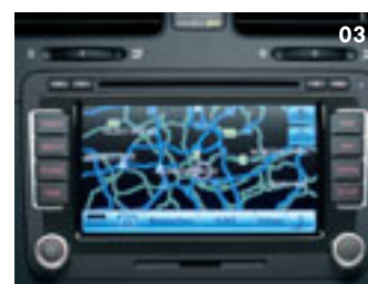
03 RNS 510 DVD touch-screen navigation/radio system.

When it comes to in-car entertainment systems and communications packages, those looking to install a technologically advanced or upgraded system are spoilt for choice. Whether you require upgraded acoustics or the latest DVD touch-screen navigation/radio system, these factory-fitted options provide the ultimate in advanced electronics, state-of-the-art technology and connectivity. Choose the system that best meets your needs, then sit back and enjoy the benefits.