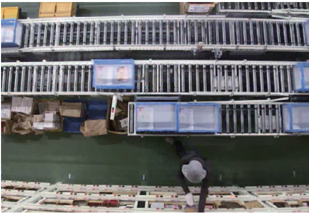
Figure 2 Video capture for quantitative data acquisition.

new functions such as those described below within the WMS, leading to further improvement of site operations.