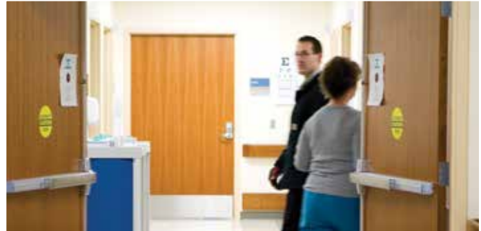
Von Duprin® INPACT® exit device

Note: These security solutions are designed only as a guide and do not take into consideration local codes and regulations that may be in place. Please contact your local Allegion representative to design a specification to meet your unique needs.