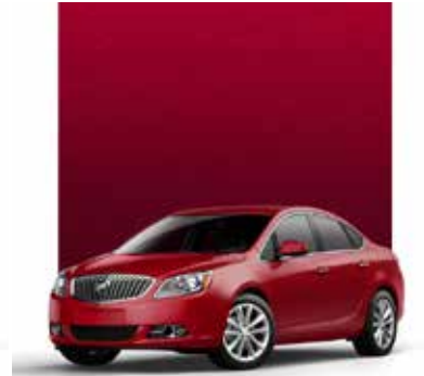
CRYSTAL RED TINTCOAT 2