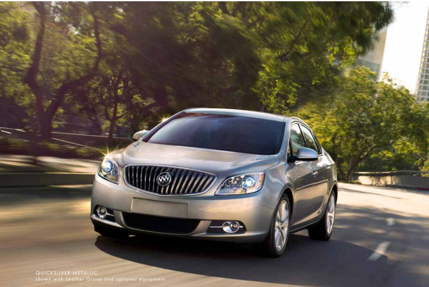
QUICKSILVER METALLIC shown with Leather Group and optional equipment.

So what are you waiting for? It's time to experience Verano for yourself.