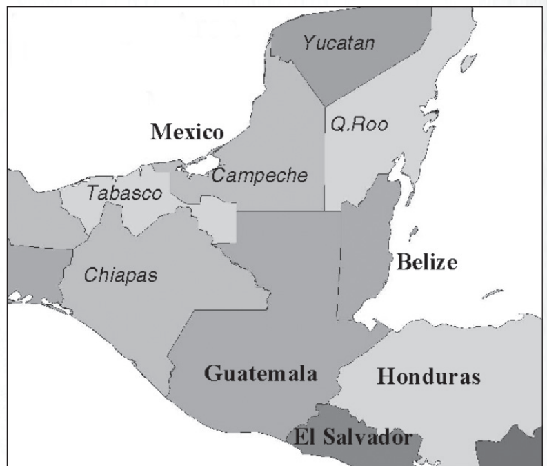
At its peak, the Mayan Empire covered about 37,000 square miles in southern Mexico and Central America.

population grew, they set down roots. They began constructing vast cities of stone with tall pyramids that had steep stairs leading up the sides to the top where powerful rulers were laid to rest. Some of these pyramids still stand today. They also built palaces for their kuhul ajaw or holy lords that were often situated on elevated stone platforms to keep them safe from seasonal flood waters. While the Maya were once considered a peaceful people, it is now believed that they were anything but. The inscriptions on the stonework they left behind show that the Maya went to war with their neighbors often, fighting not only to protect their cities, but for the prestige of victory and to take prisoners who became their slaves. Despite those bloody battles, the Mayan empire thrived for nearly 2,000 years.