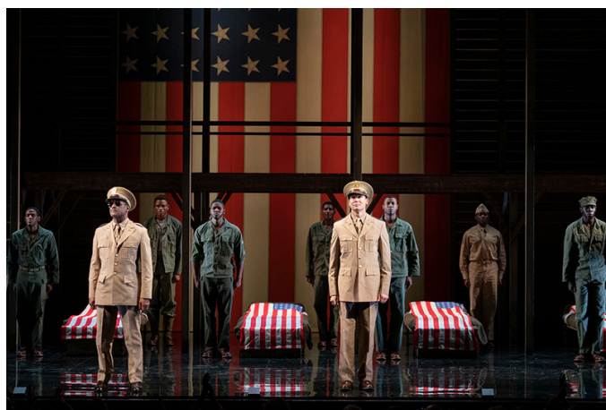
A Soldier's Play

CTI: How did you know that lighting design was for you?