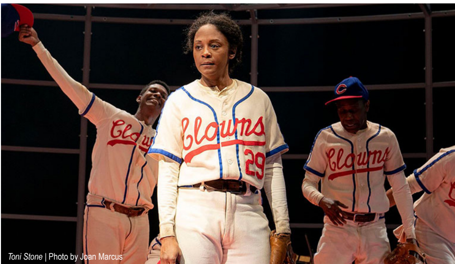
Toni Stone