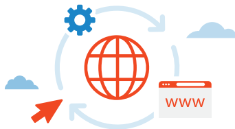
SDK FOR WEB