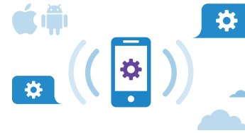
SDK FOR MOBILE