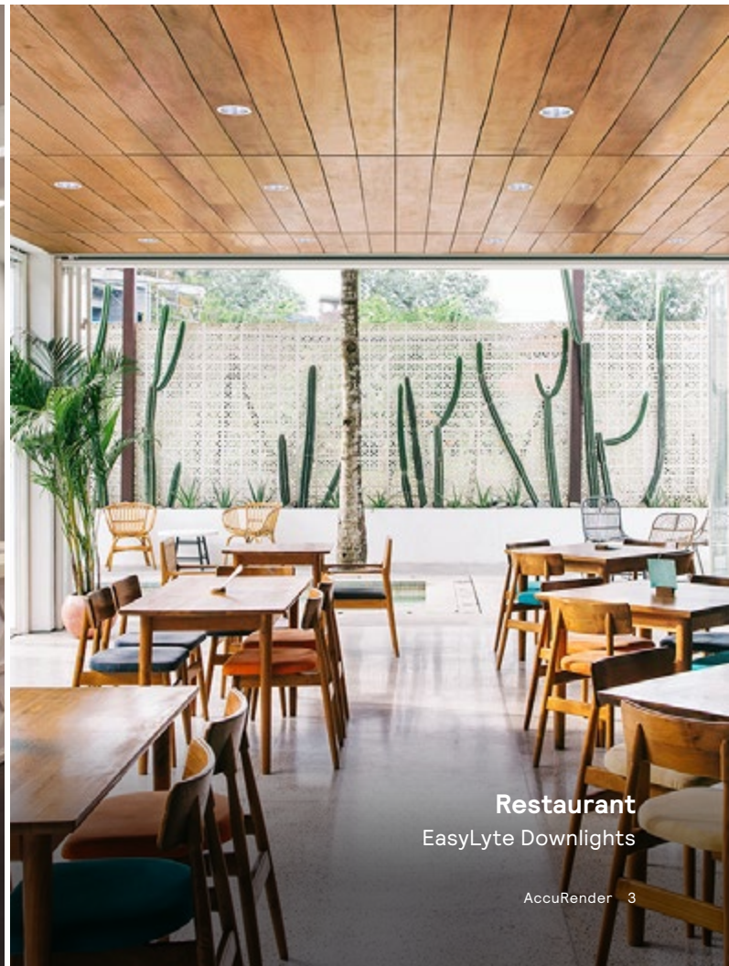
Restaurant EasyLyte Downlights