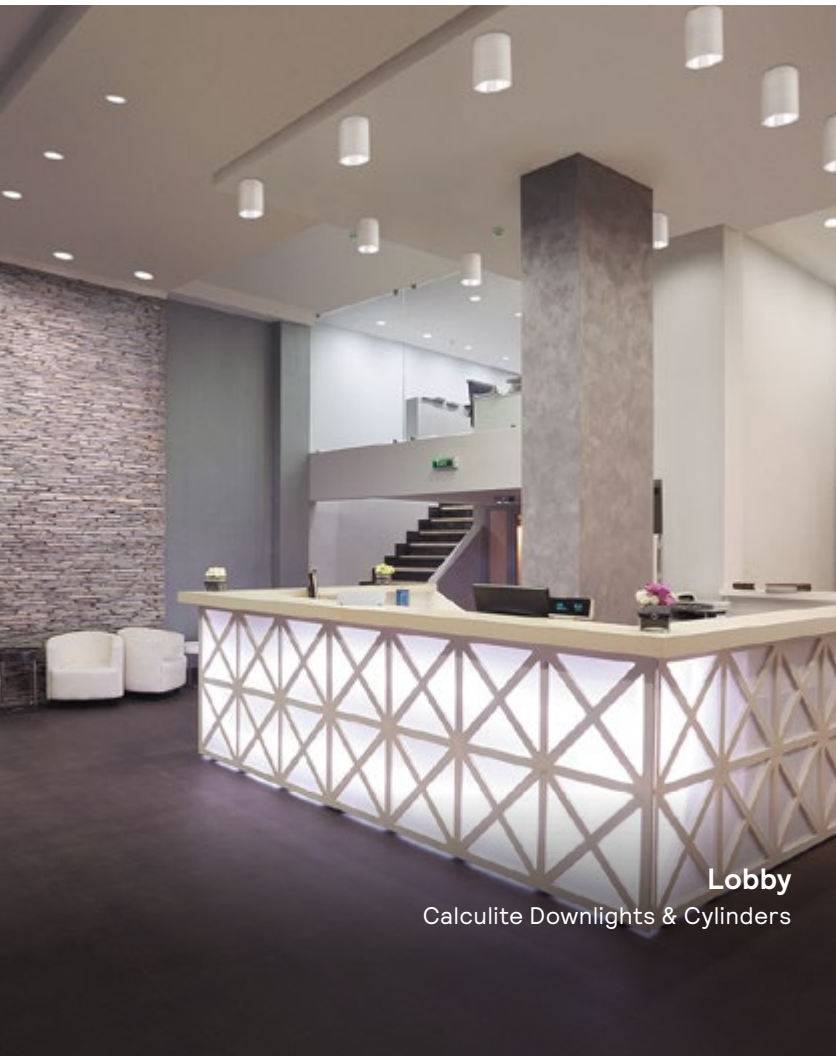
Lobby Calculite Downlights & Cylinders