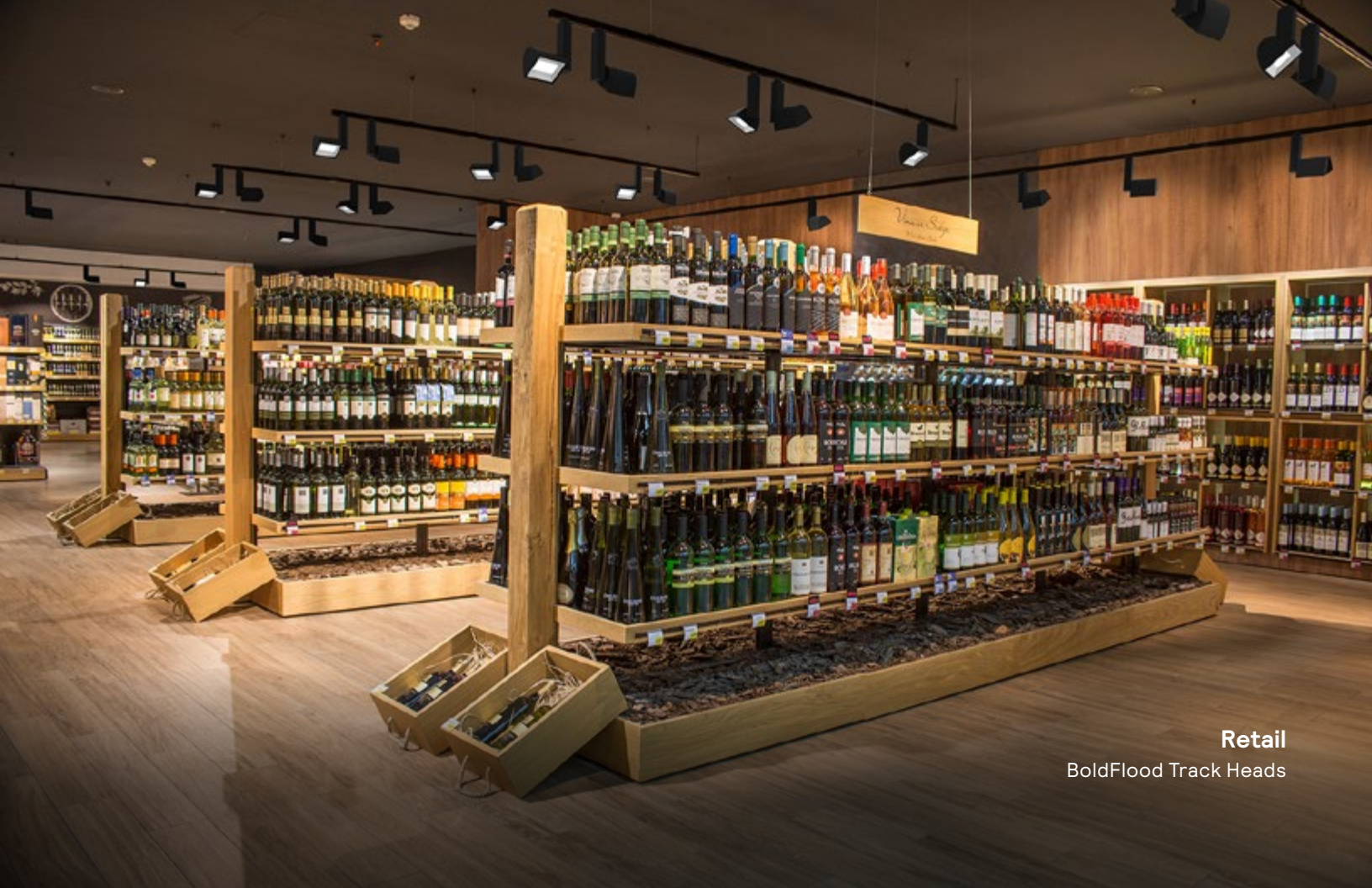
Retail BoldFlood Track Heads