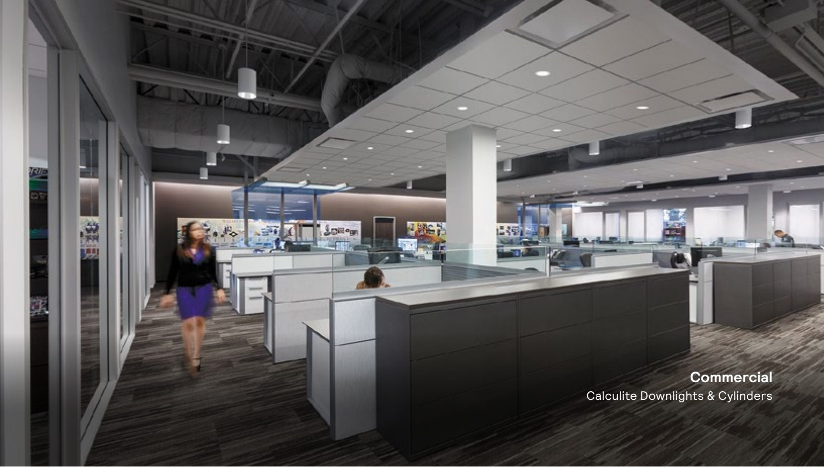
Commercial Calculite Downlights & Cylinders