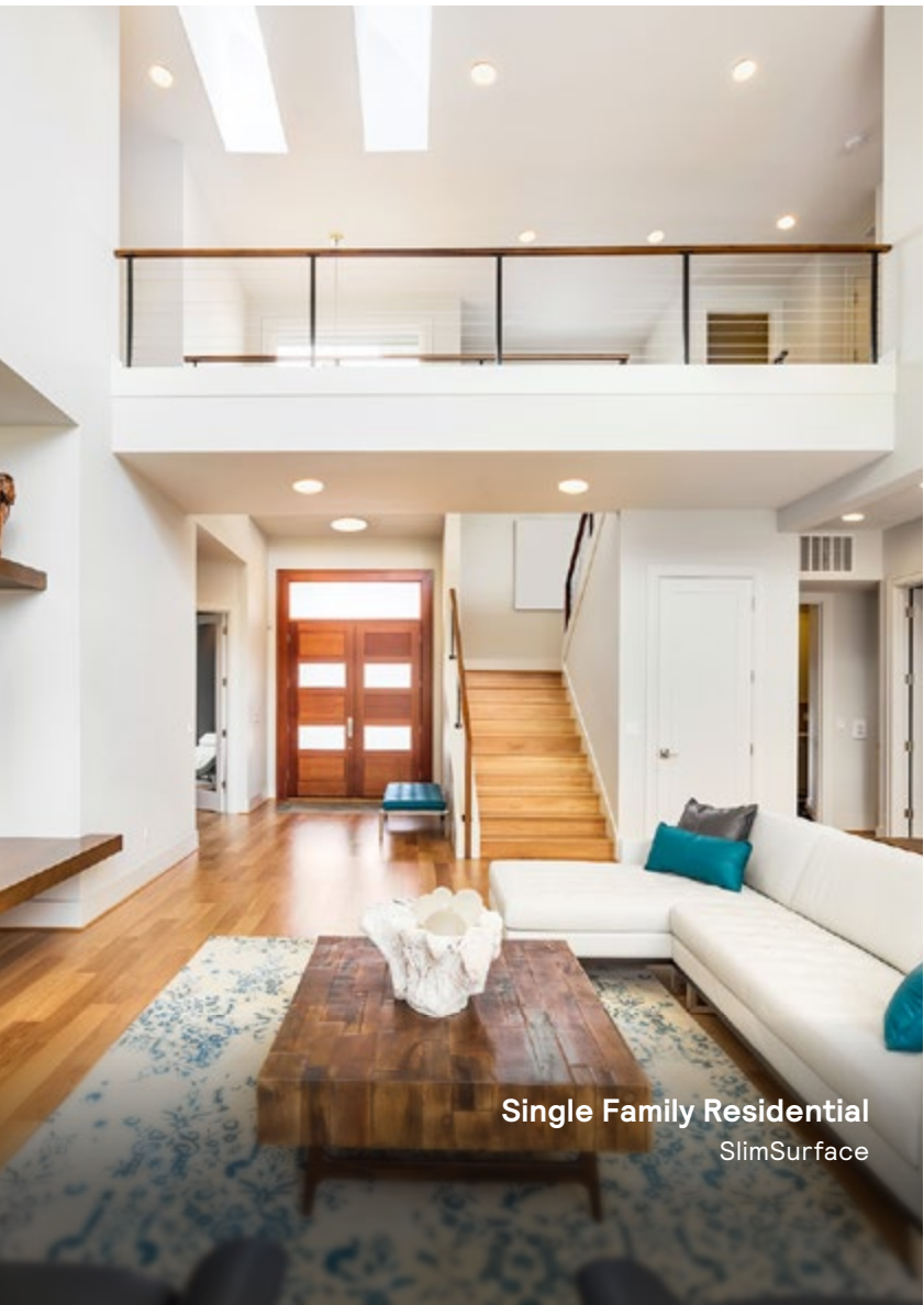
Single Family Residential SlimSurface