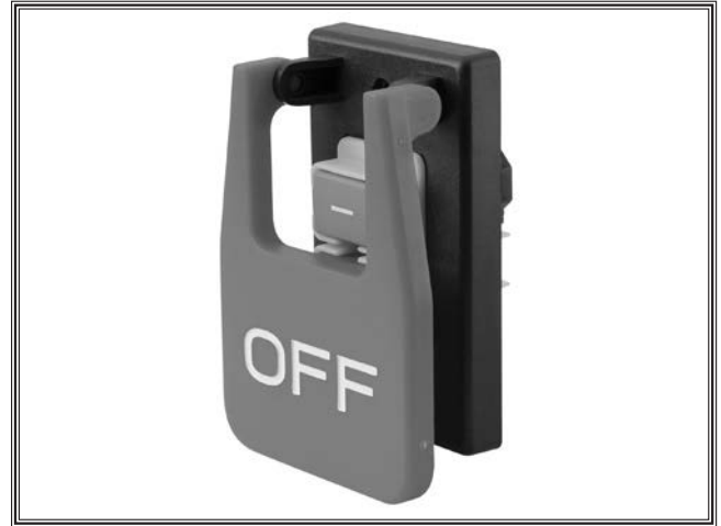
Figure 1. D4160 ON/OFF Paddle Switch.