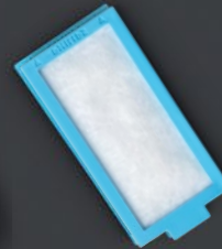
Ultrafine pollen filter