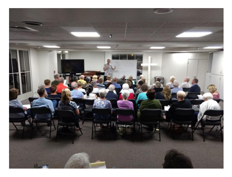
COLLEGE OF THE BIBLE