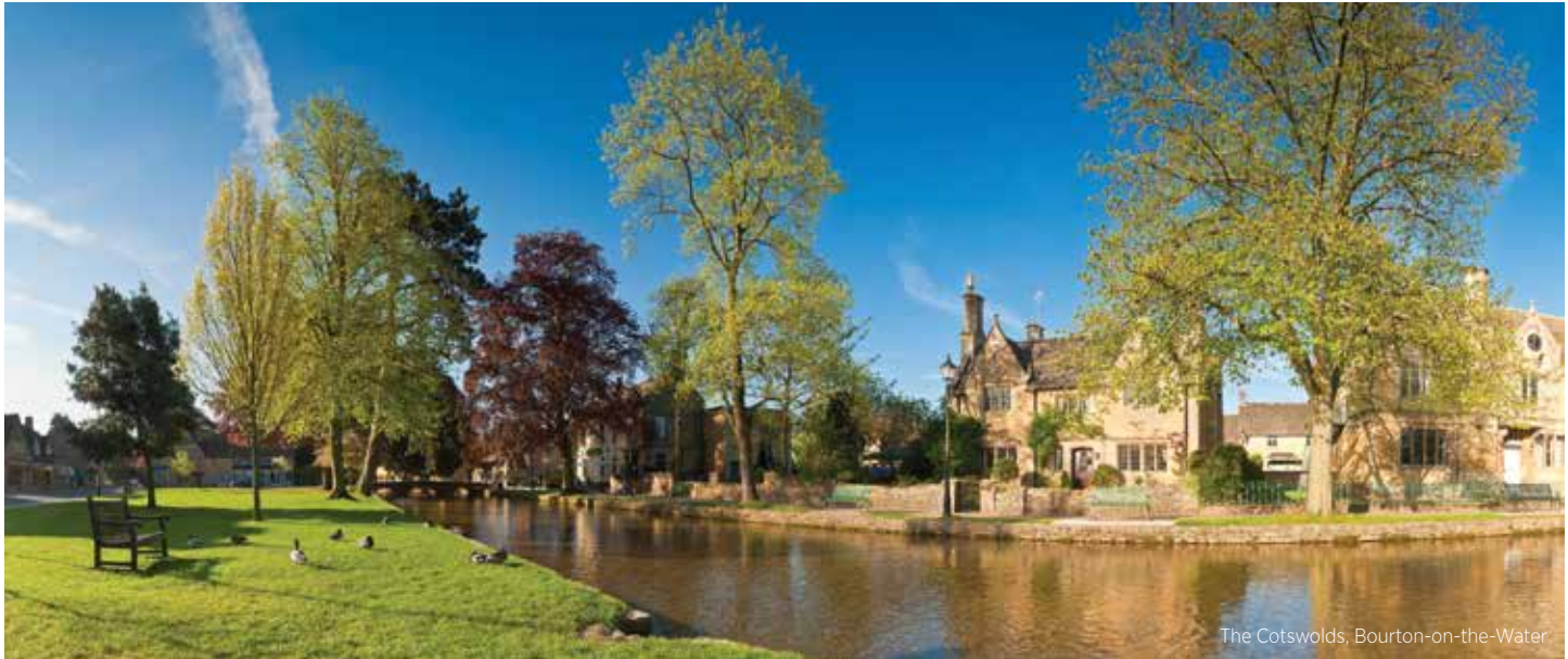
The Cotswolds, Bourton-on-the-Water

If you want to find a location which really epitomises the spirit of Britishness in the same way that afternoon tea does, Bourton-on-the-Water is the perfect spot. It's not just a clever name - Bourton sits upon the River Windrush which runs down the middle of the high street between two sweeping greens, making it one of the most picturesque villages in the UK. Strolling around the 'Venice of the Cotswolds' gives you the chance to explore the local attractions including the model village (which includes a model of the model village itself), the model railway, the dragonfly maze or Birdland to make your afternoon tea a delicious part of a varied and interesting day out.