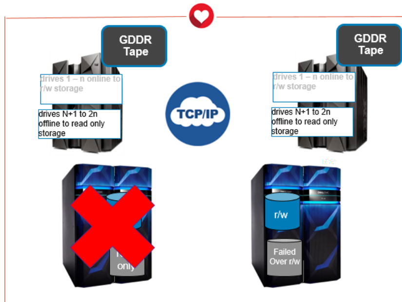
Figure 3. Use of GDDR Tape to automate failover of sites

Dell EMC replication software enables network-efficient replication to one or more disaster recovery sites. Data can be encrypted in-flight when being replicated between Data Domain systems.