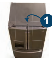
French Door Refrigerators

► French door refrigerators have the communication port on top of the case and behind the doors. You may need to remove a plastic port plug first.