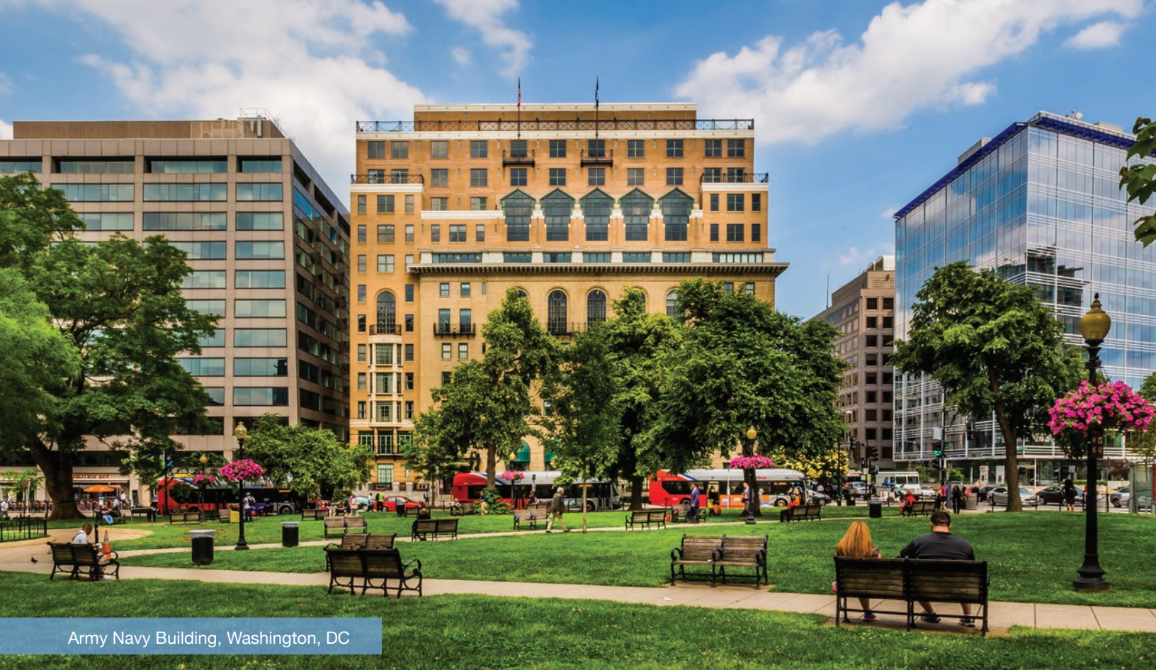
Army Navy Building, Washington, DC