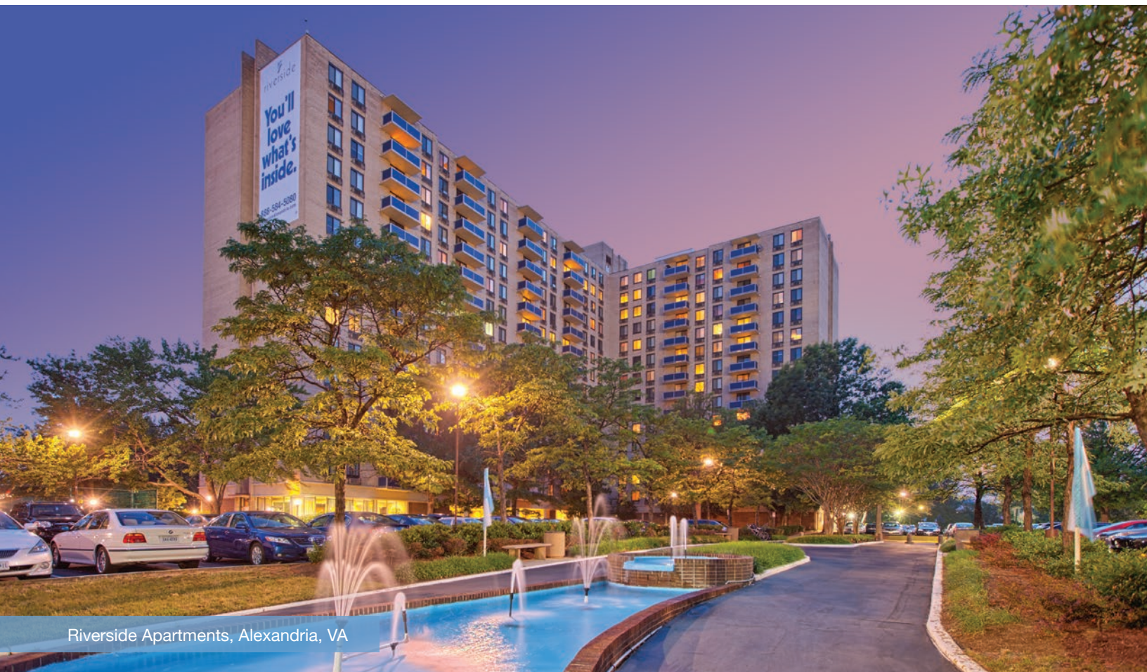
Riverside Apartments, Alexandria, VA