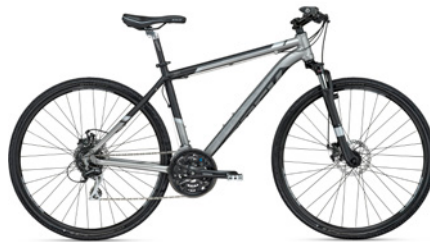
2012 Trek 8.3 DS