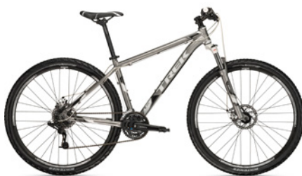
2012 Trek Marlin