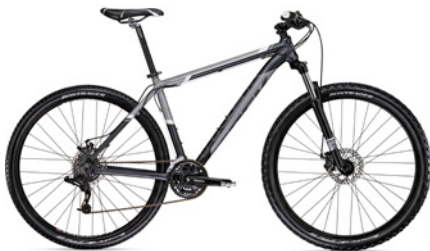
2011 Trek Marlin