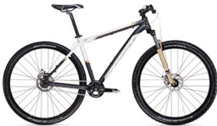
2011 Trek Marlin SS