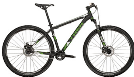
2012 Trek Marlin SS