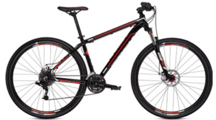
2013 Trek Marlin