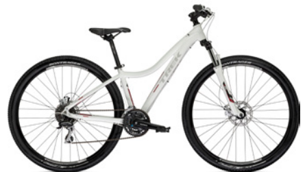
2013 Trek Cali