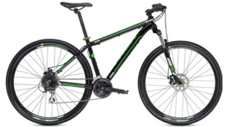
2013 Trek Wahoo