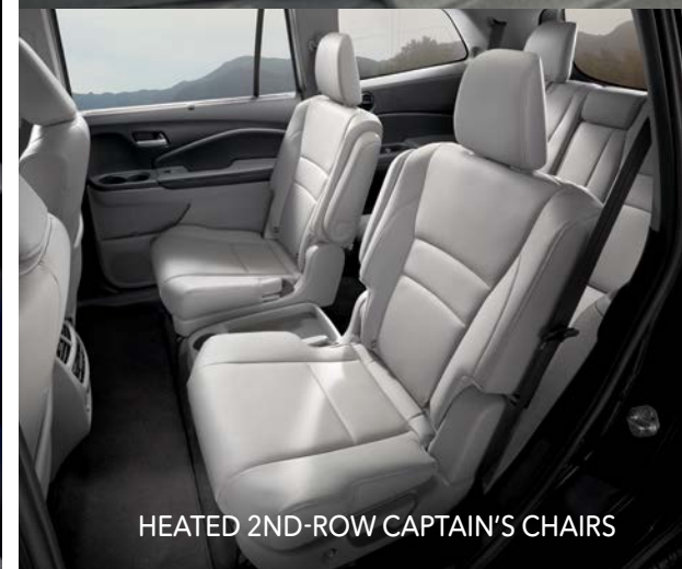
HEATED 2ND-ROW CAPTAIN'S CHAIRS