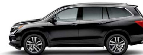
TOURING & ELITE