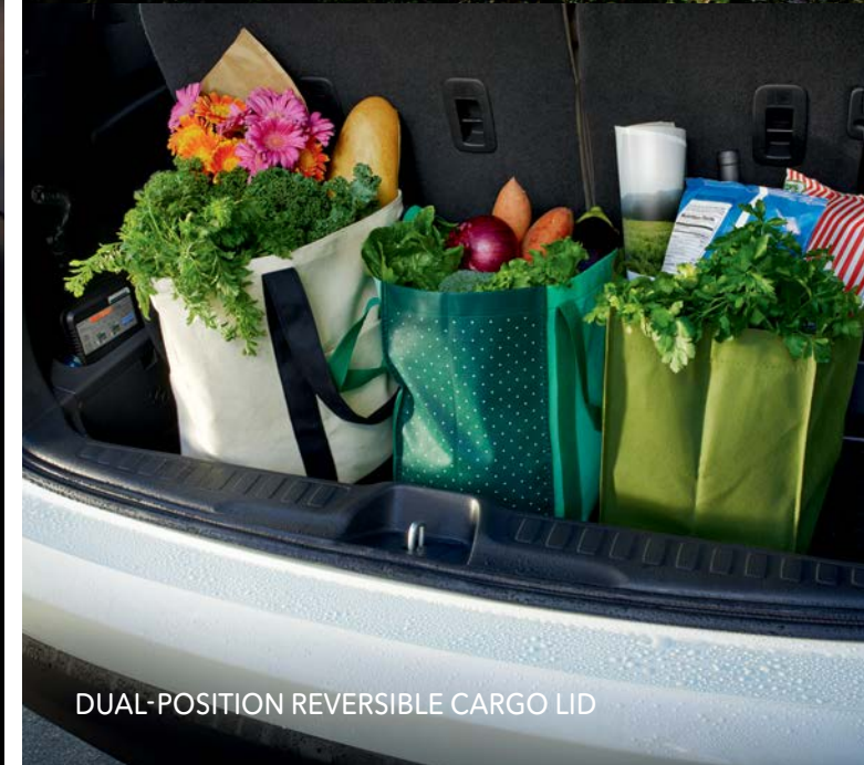
DUAL-POSITION REVERSIBLE CARGO LID