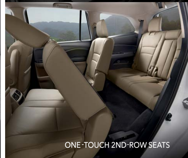
ONE-TOUCH 2ND-ROW SEATS