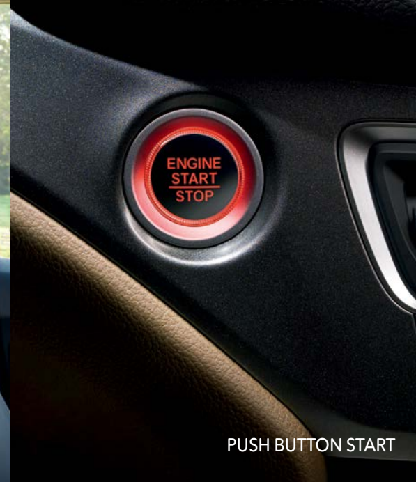
PUSH BUTTON START