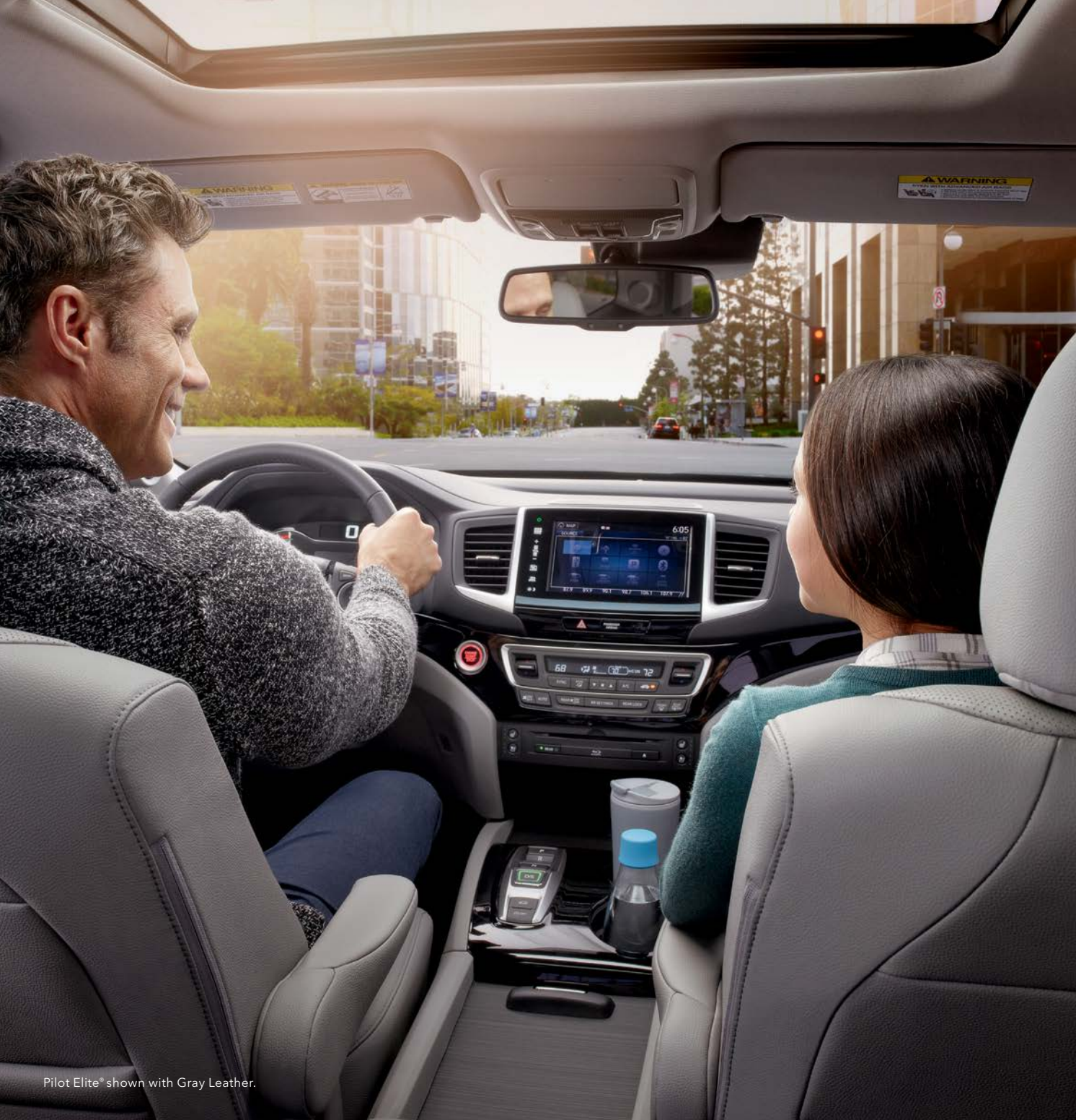
Pilot Elite® shown with Gray Leather.