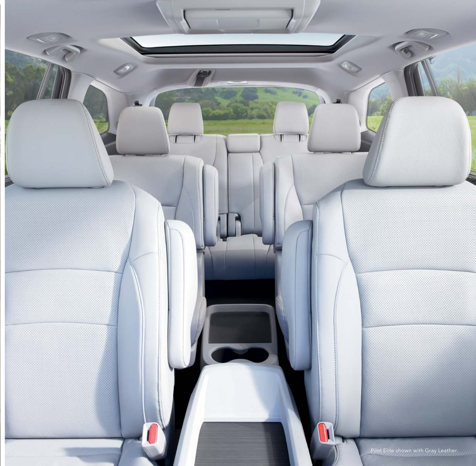
Pilot Elite shown with Gray Leather.