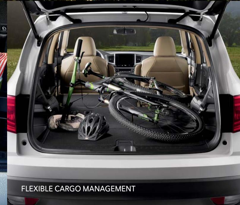
FLEXIBLE CARGO MANAGEMENT

Flip the cargo lid up when you need a deeper space for taller items, or turn it over to keep the carpeted side clean when carrying wet or dirty items.