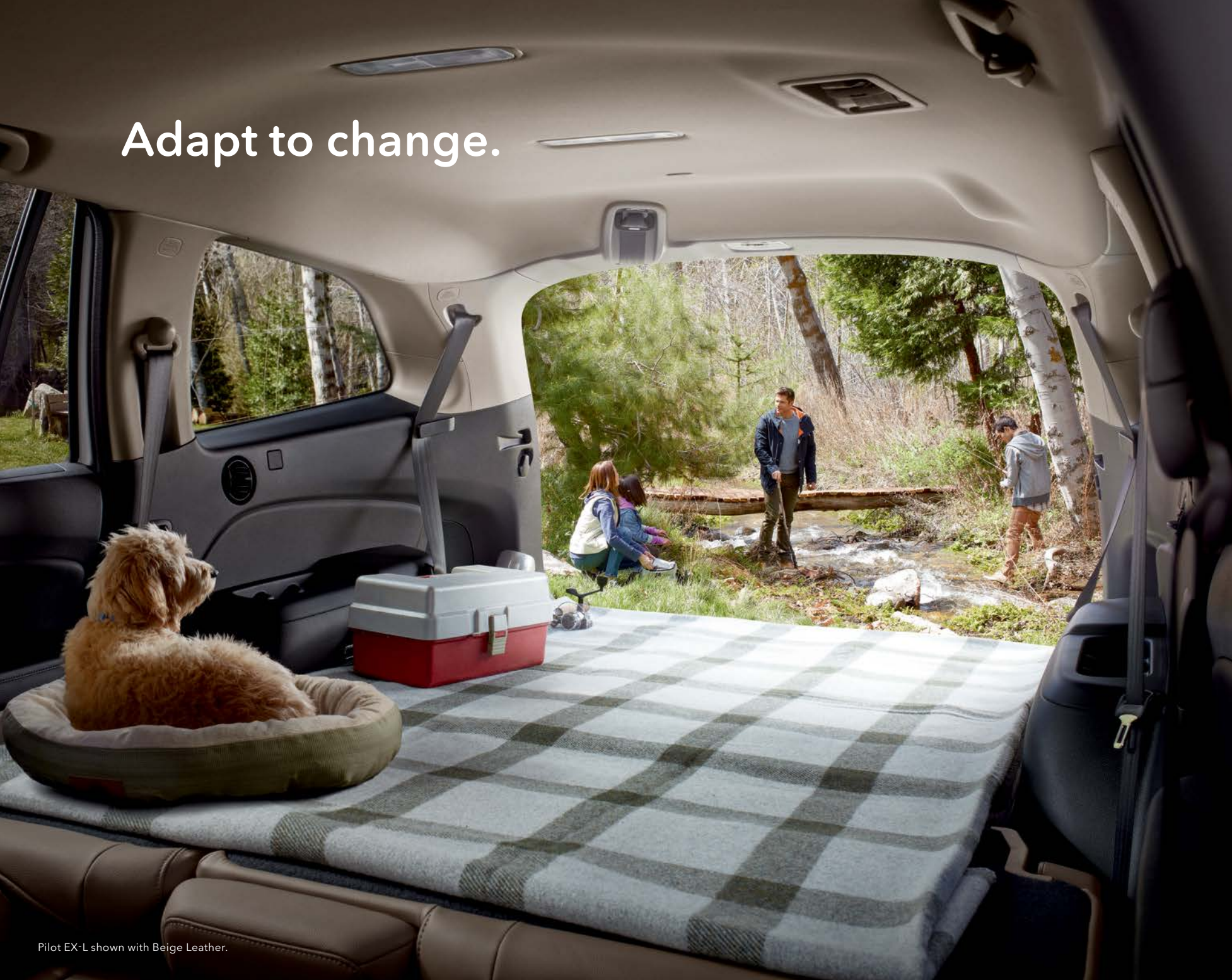
Pilot EX-L shown with Beige Leather.