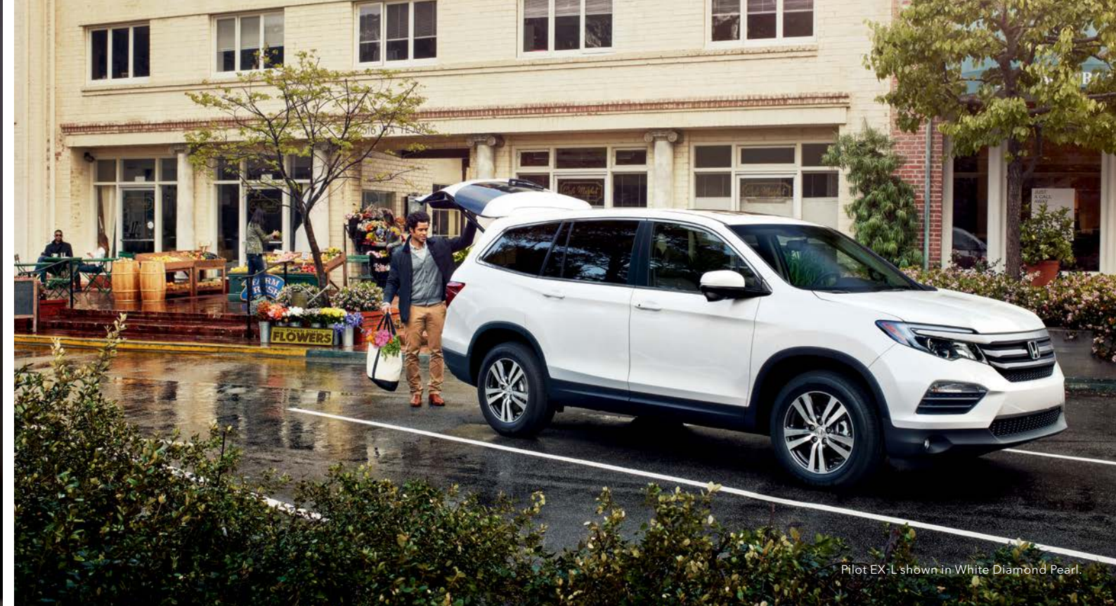
Pilot EX-L shown in White Diamond Pearl.

No two days are ever the same. So you need a vehicle that can quickly shift focus to match your evolving interests. The Pilot does just that with an agile interior delivering a seemingly limitless level of versatility.