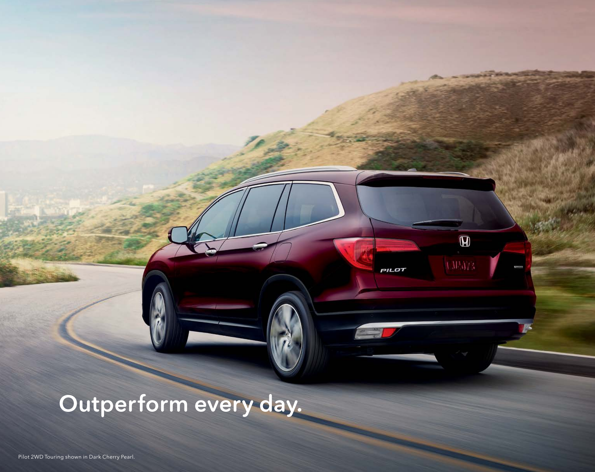
Pilot 2WD Touring shown in Dark Cherry Pearl.