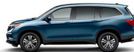
EX & EX-L