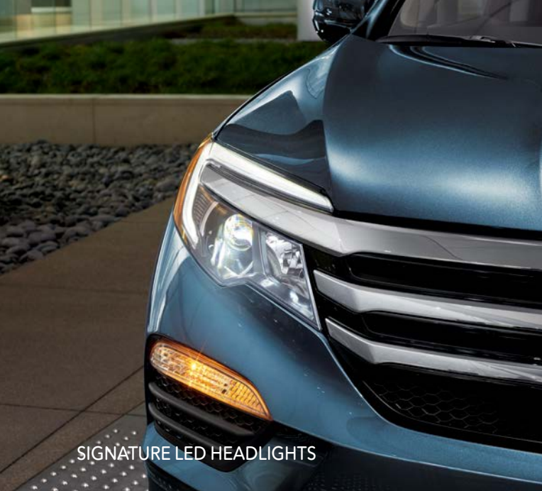
SIGNATURE LED HEADLIGHTS