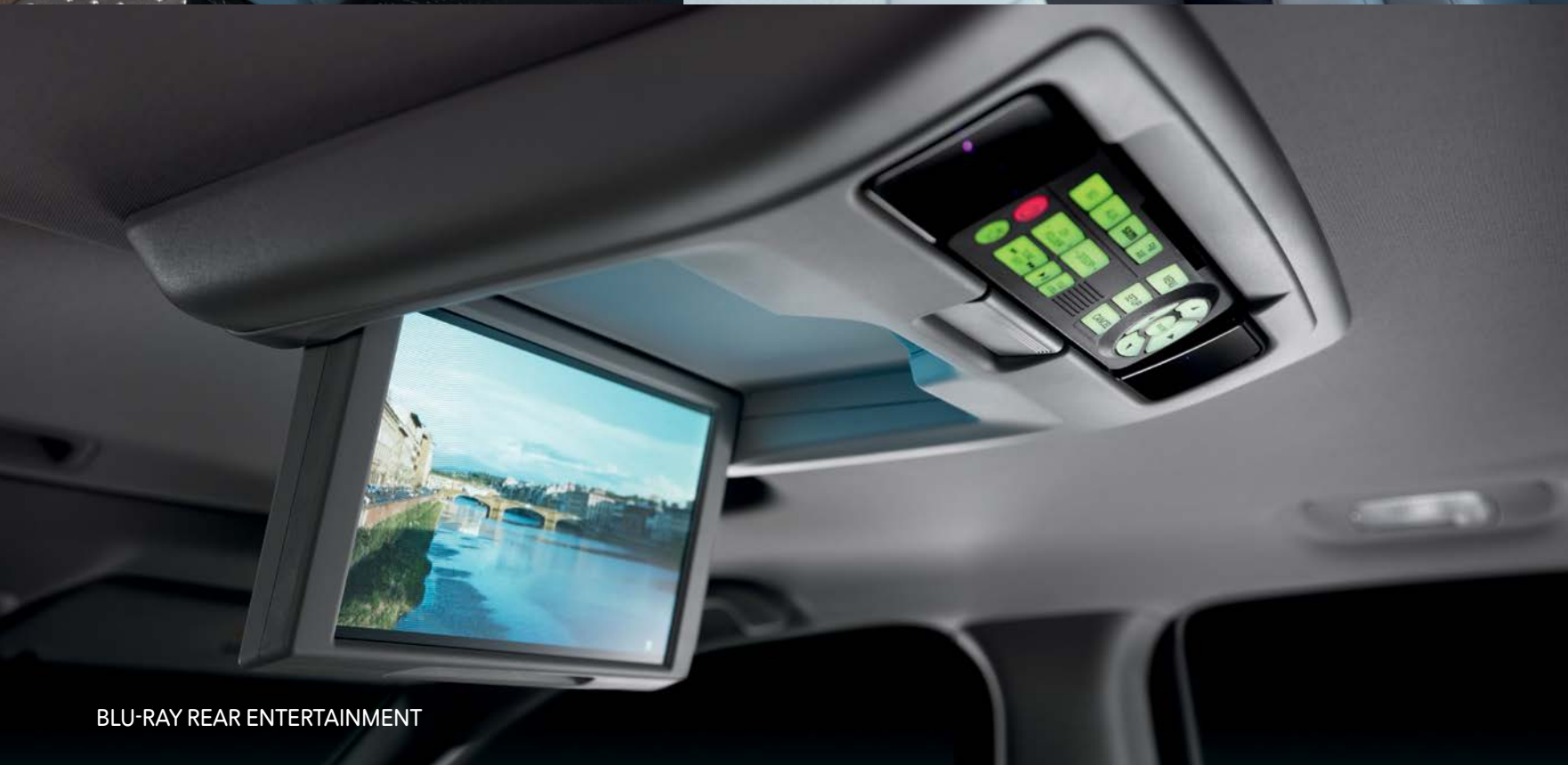
BLU-RAY REAR ENTERTAINMENT