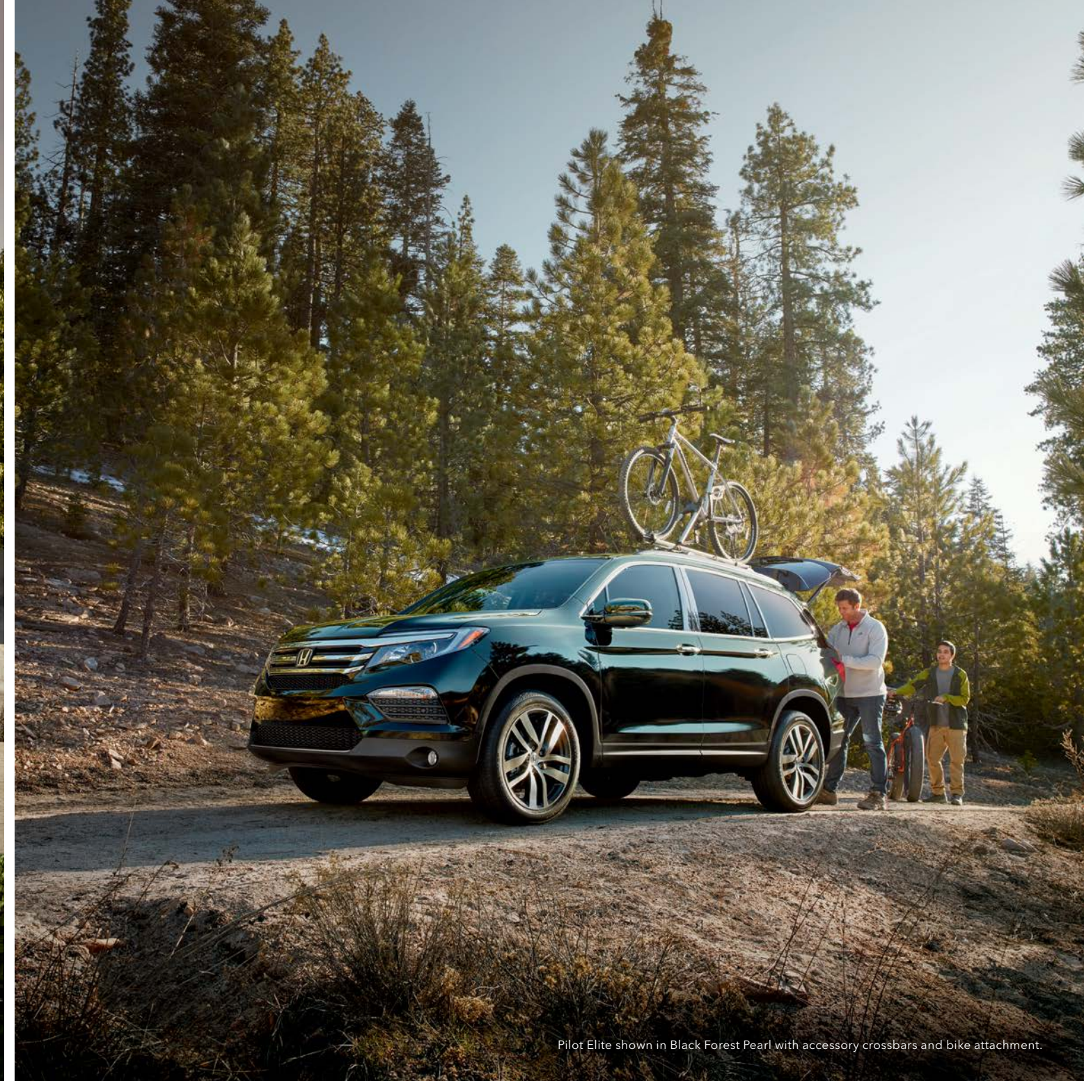
Pilot Elite shown in Black Forest Pearl with accessory crossbars and bike attachment.

The Pilot is at home wherever you park it. It's been completely restyled with a bold, new look that makes it stand out in a crowd and sleek, clean lines that help it fit in to any environment.