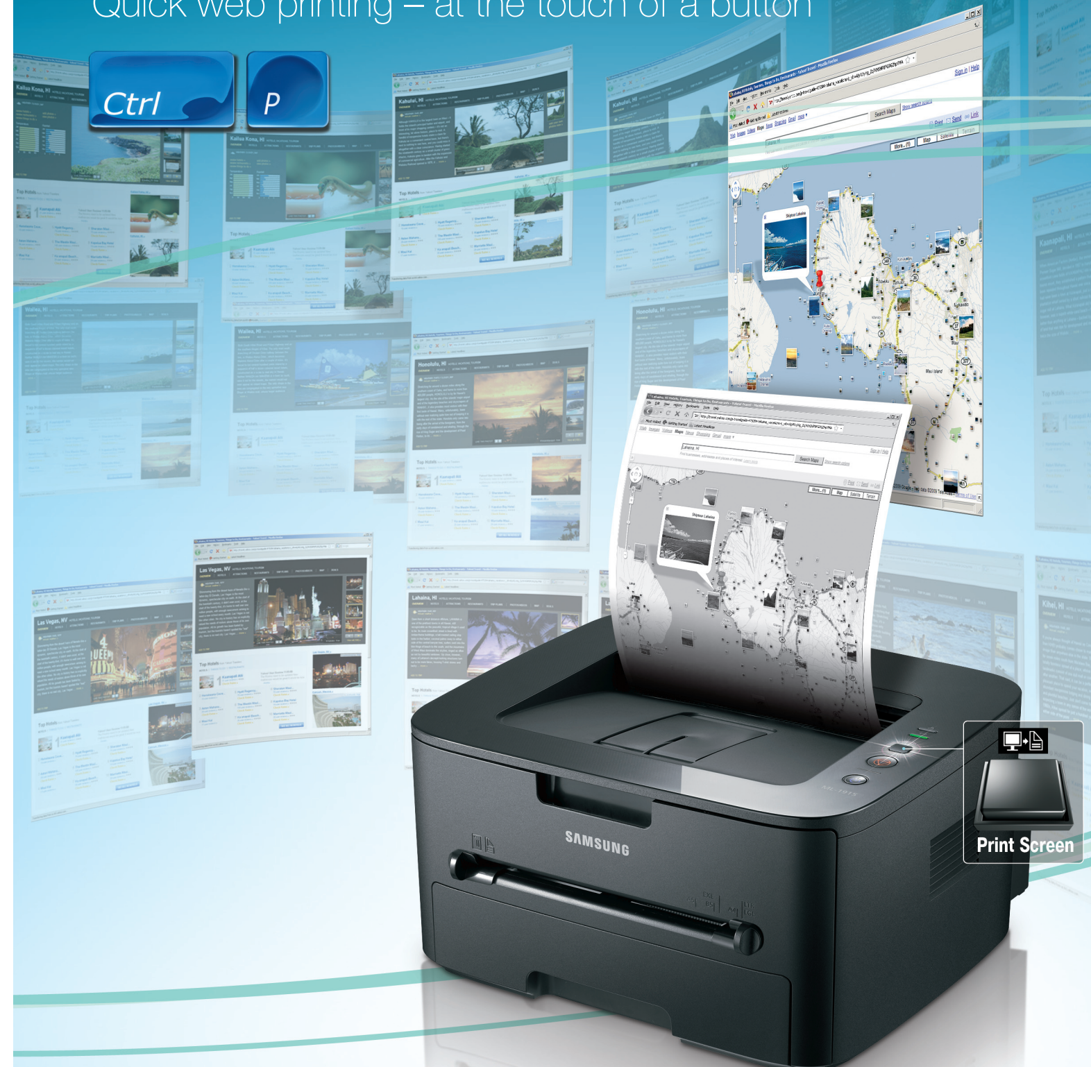
Samsung Monochrome Laser Printer ML-1910/1915/2525

See it, print it. Quick web printing – at the touch of a button