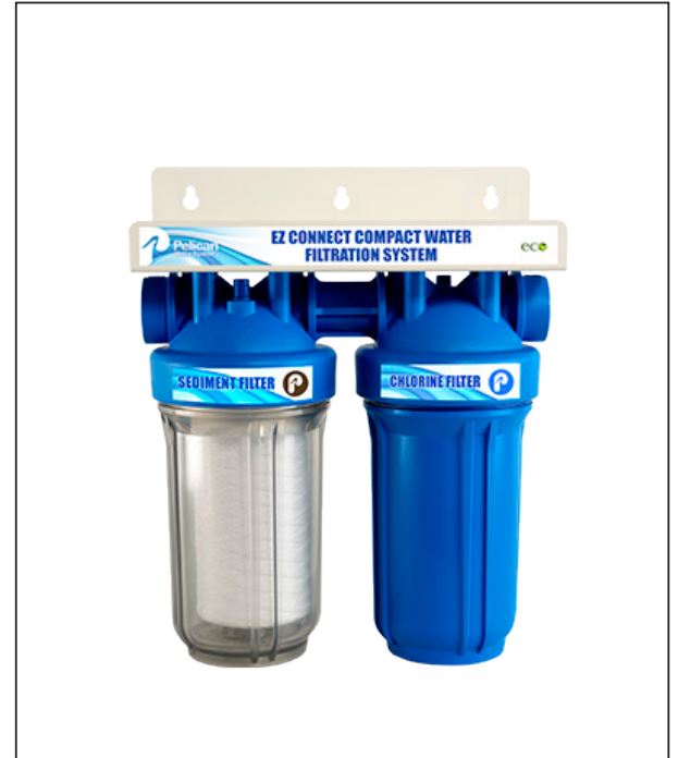
Front of Pelican EZ Connect PC-100