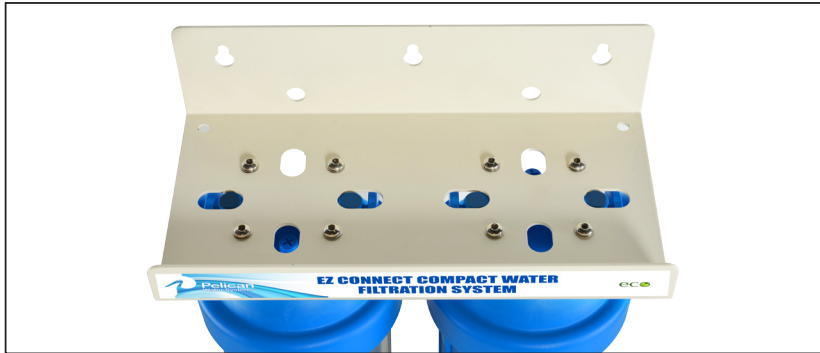
Top of Pelican EZ Connect PC-100