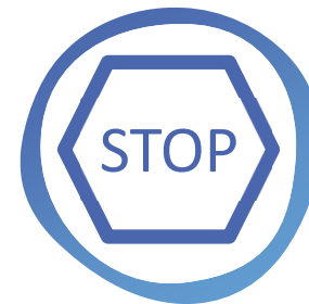
License Suspension And Revocation