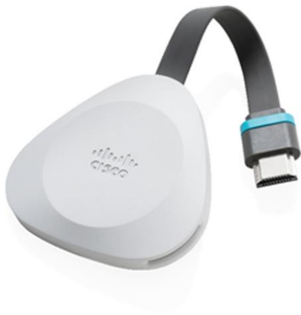
Figure 1. Cisco Webex Share

Cisco Webex Share complements the premium portfolio of Cisco Webex collaboration devices, enabling conference rooms and huddle spaces to offer the same Webex user experience as Cisco's video devices.