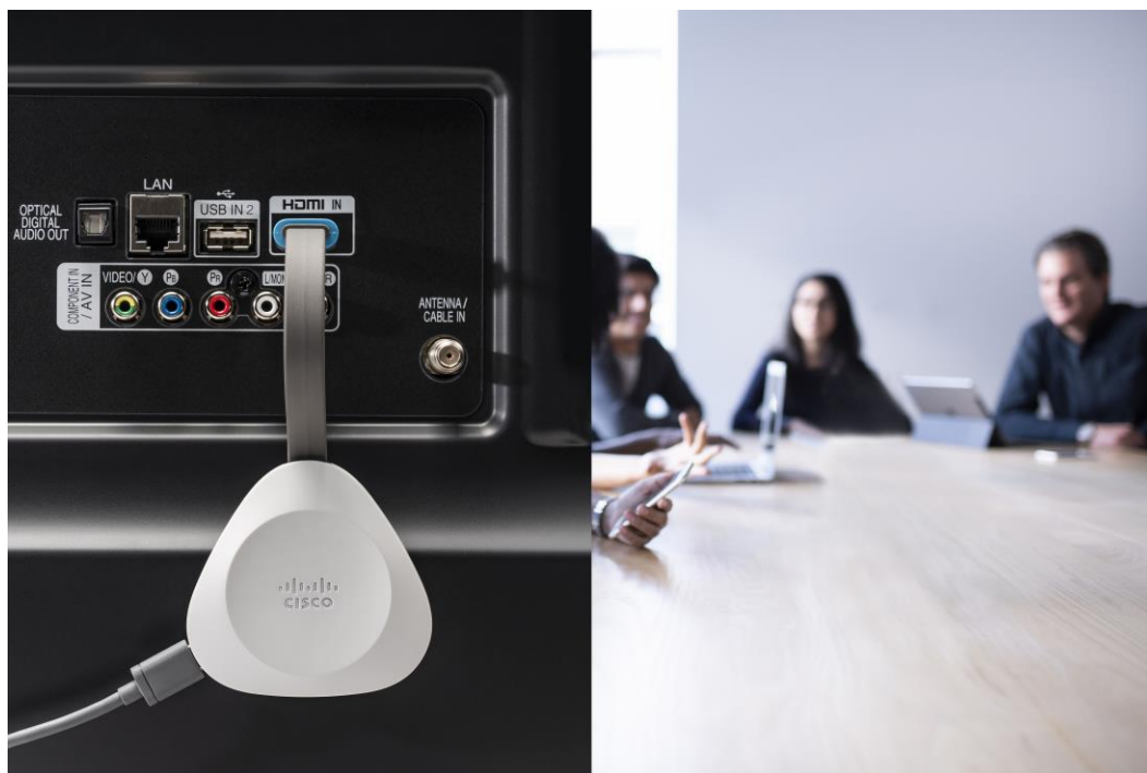
Figure 3. Webex Share installation

Cisco Webex Share is installed behind the screen (Figure 4). The package includes a cable management sticker that allows users to correctly position the device behind the display and to avoid mechanical stress on the HDMI port. The HDMI cable has been designed to sustain the device weight.