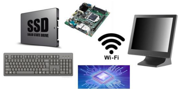
Figure 3. Simplified Components of a Computer

While it may not be practical to have full transparency at each passive component level, it is important to have transparency at active component level and to establish trust in the entire supply chain, which requires industry-