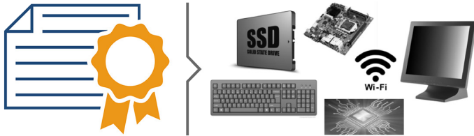
Figure 4. Simplified Components of a Computer, with a Certificate of Authenticity

The shortcoming of this type of approach is that each component has additional cost of obtaining certificate and complexity of providing a report-out, and such approach provides information only about components that include report-out capability. However, the customer does not have the benefit of transparency from any component that does not implement this capability.