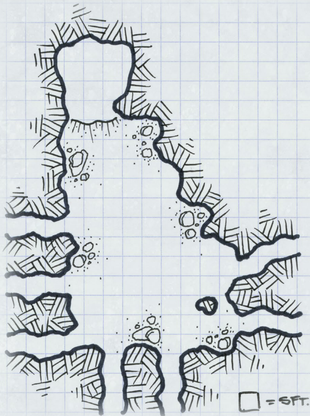
THE ICE SLIDES